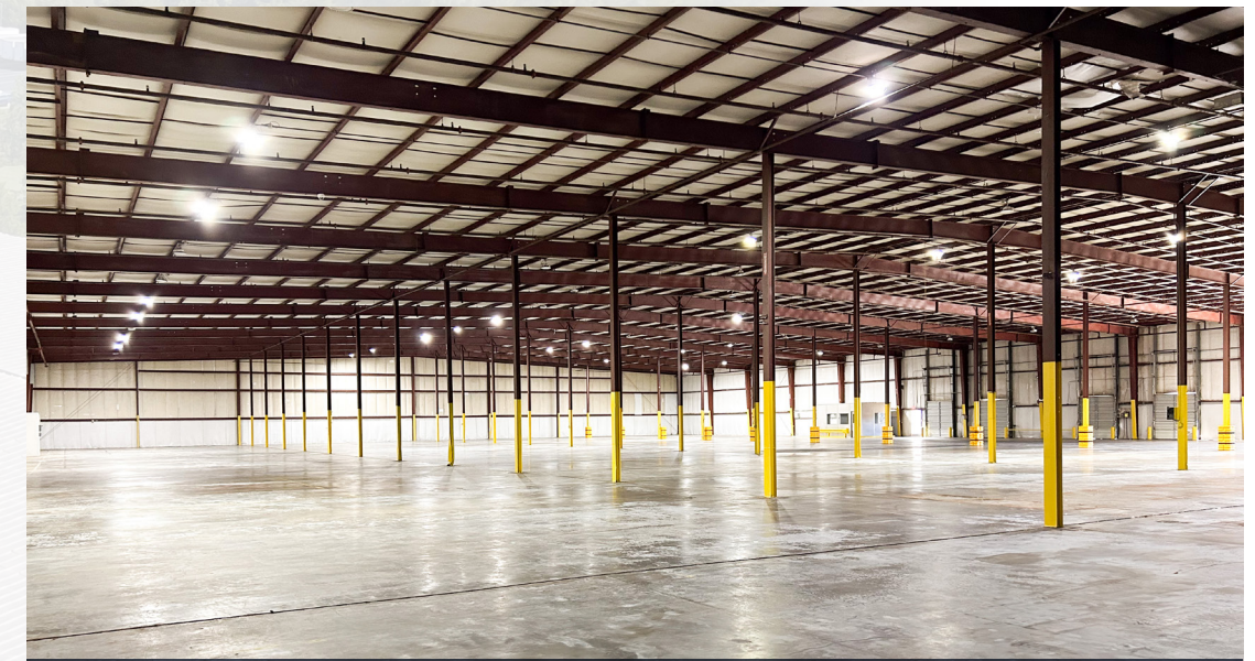
±102,000-SF INDUSTRIAL BUILDING FOR SALE OR LEASE

The building features 11 dock high doors and 1 drive-in door with a ±1,600 sf covered loading platform near the truck court. Ceiling heights throughout the building range from 21' - 25' with a wet / dry sprinkler system.