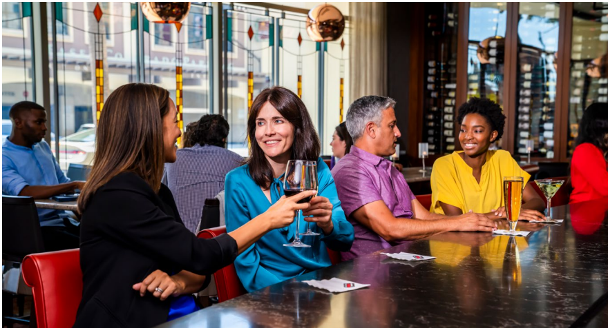
RUTH'S CHRIS STEAK HOUSE