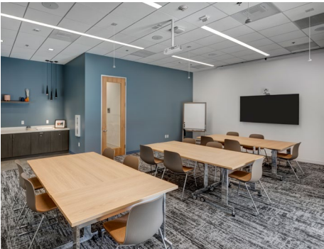
VENUE MEETINGS & EVENTS