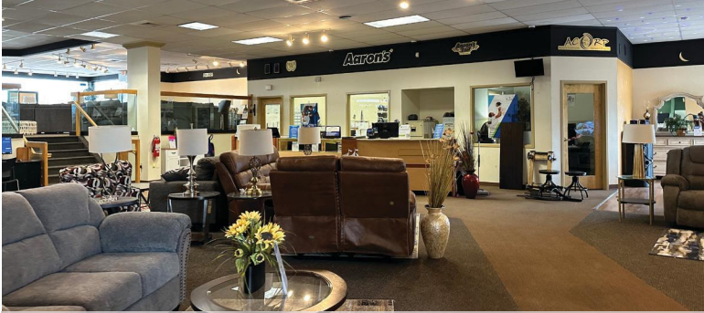
Showroom and Office