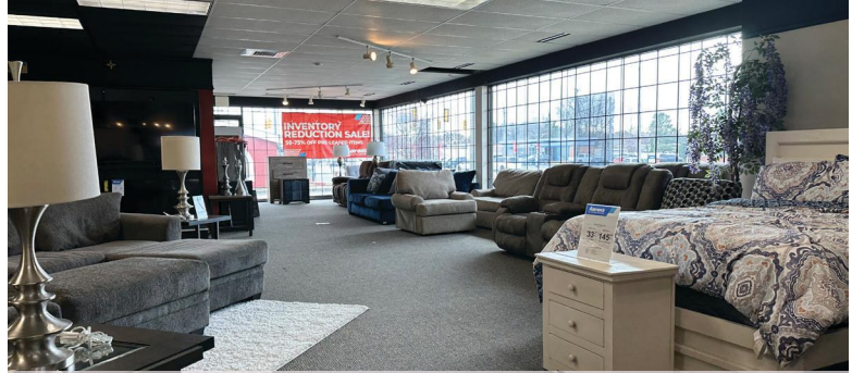
Upper Floor Showroom