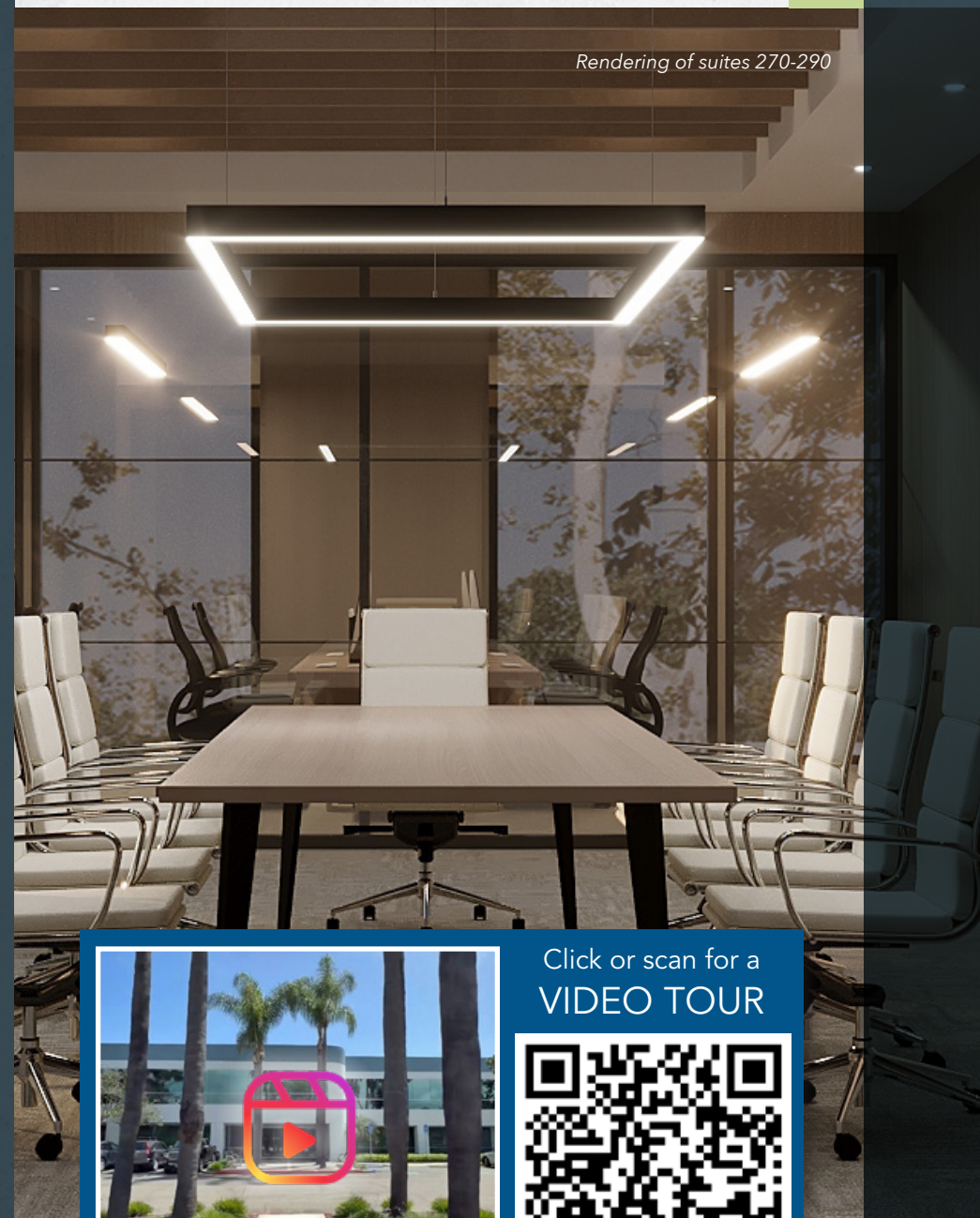
Rendering of suites 270-290