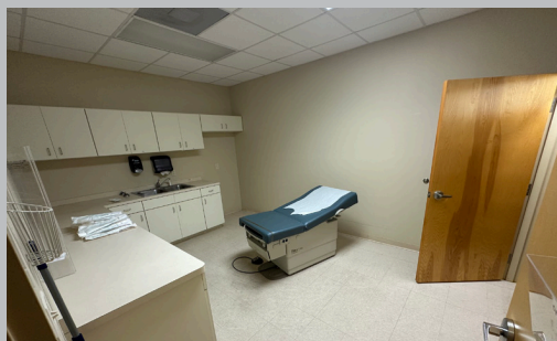
Previous use: Urology

Building 2000, Unit 2002 1,678 SF Medical or Professional