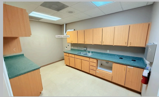
Formerly a dental practice

Building 400, Unit 402 1,986 SF Medical or Professional