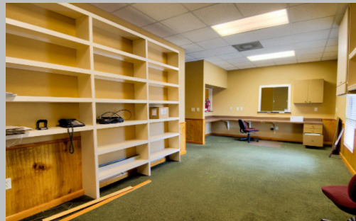
Needs renovation. Can be combined w 2002

Building 300, Unit 302 2,015 SF Medical or Professional