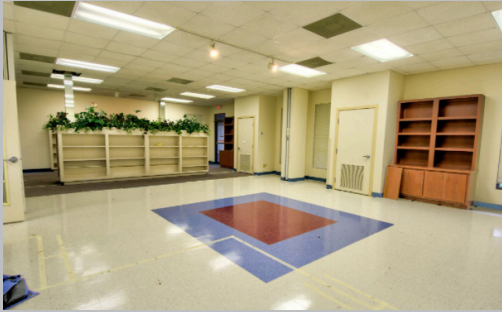
2 Adjoining spaces