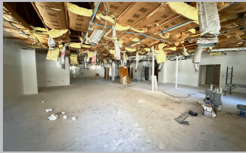
Bring All Offers - TI Available