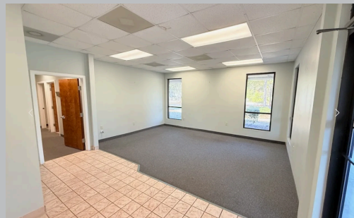
Formerly a prosthetics practice

Building 3000, Unit 3001 1,784 SF Ideal for Medical