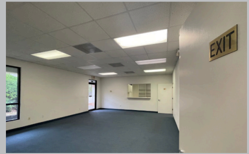
Carpet, Medical, New Paint 9/25

Building 300, Unit 303 3,325 SF Large Rooms & Offices