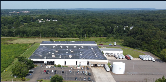
385 Long Hill Road, Guilford, CT ~127,000 SF