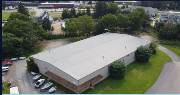
39B Plains Road, Essex, CT ~24,000 SF