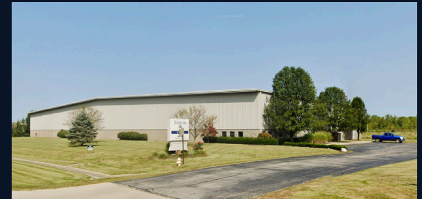
3500 W Industries Road, Richmond, IN ~45,000 SF