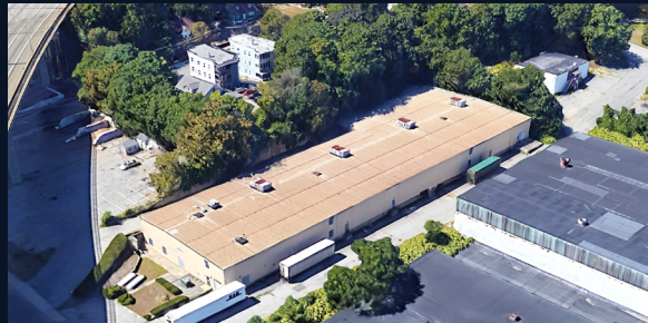
56 Lewis Street, New London, CT ~67,751 SF