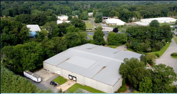
39A Plains Road, Essex, CT ~40,000 SF