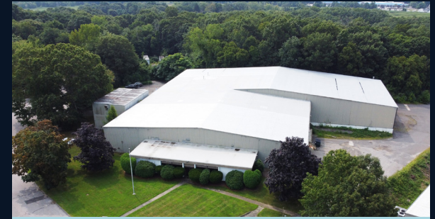
9 Heritage Park, Clinton, CT ~42,000 SF