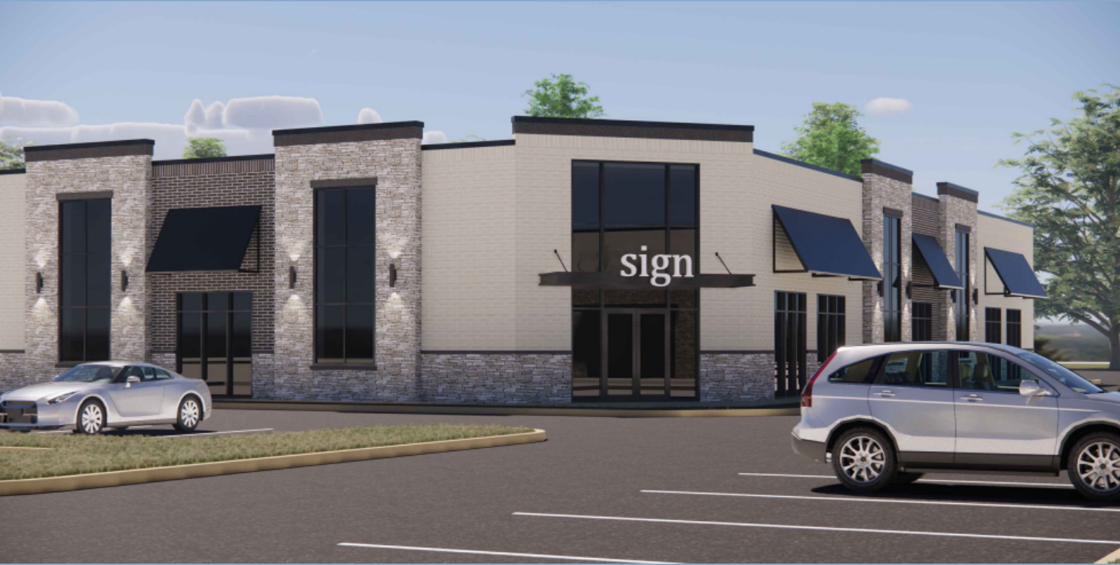
*Potential Design Concept*