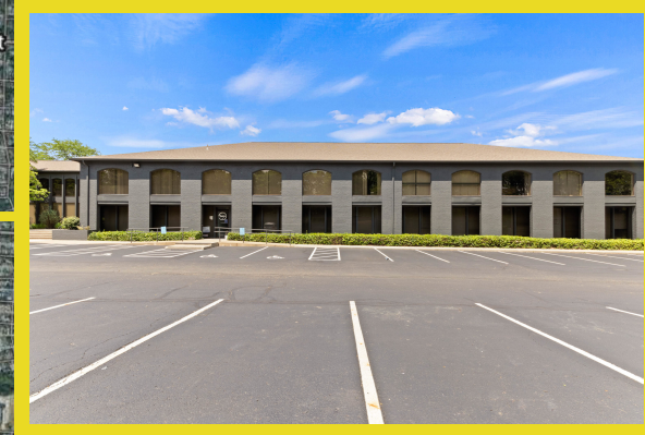
Kenny Rd Campus