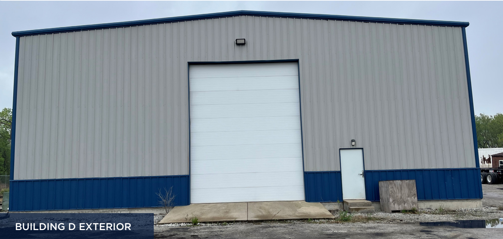
BUILDING D EXTERIOR