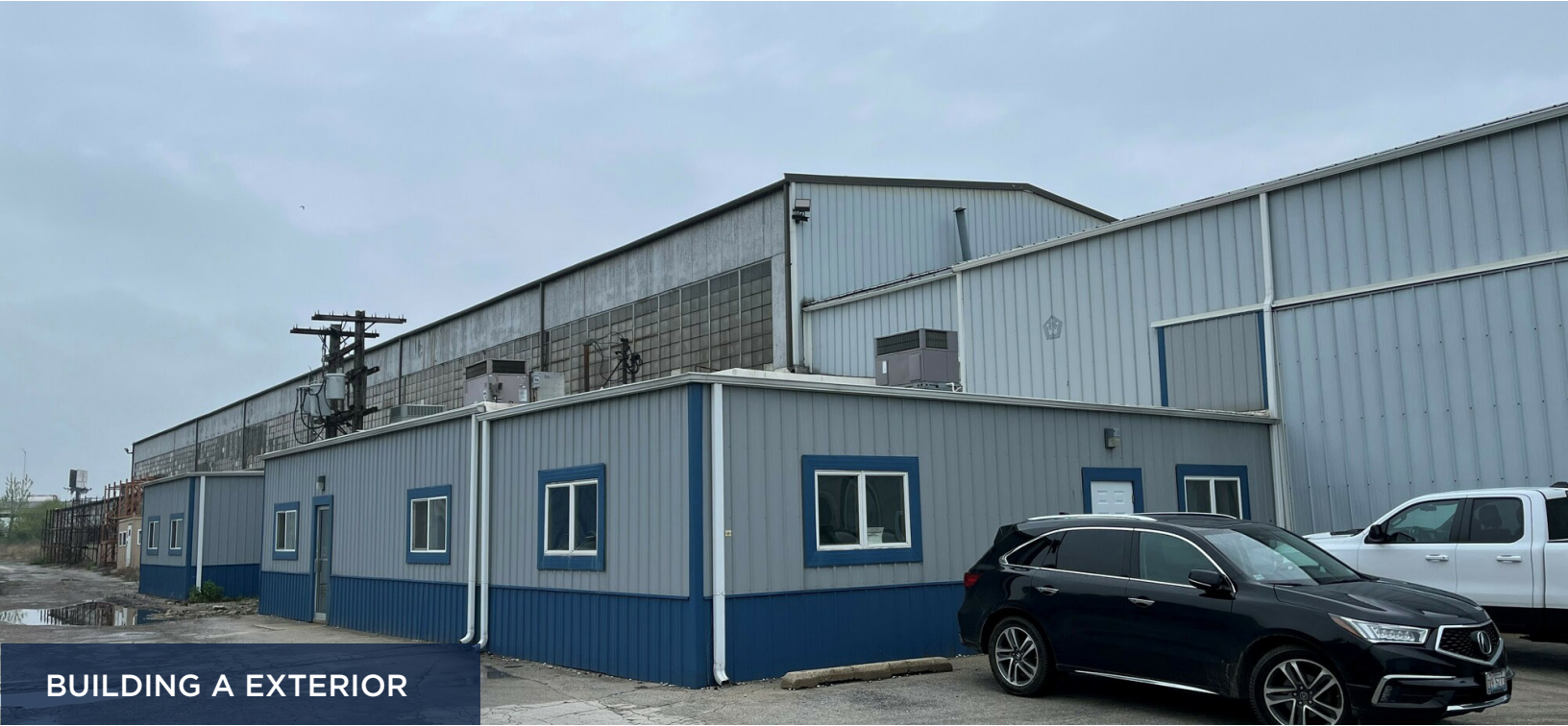
BUILDING A EXTERIOR