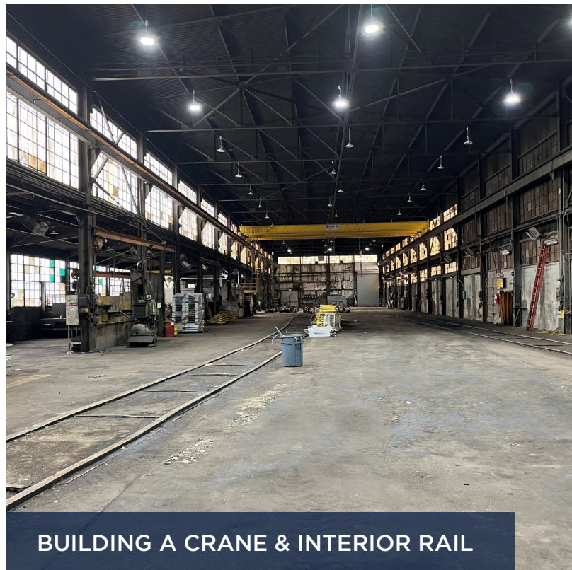
BUILDING A CRANE & INTERIOR RAIL