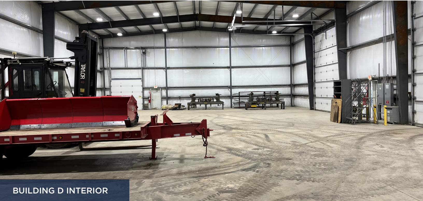
BUILDING D INTERIOR