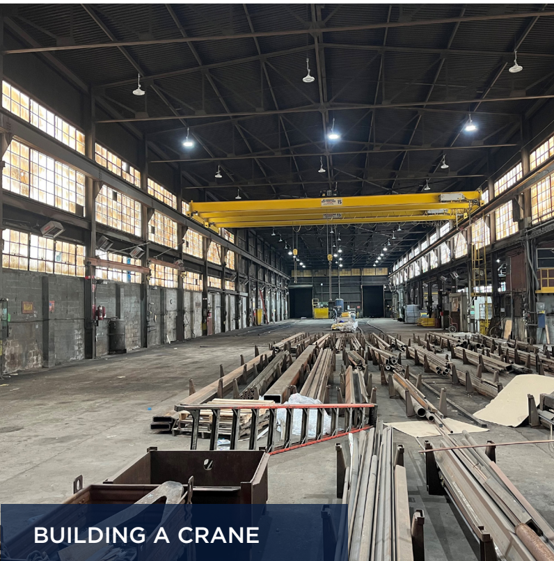
BUILDING A CRANE