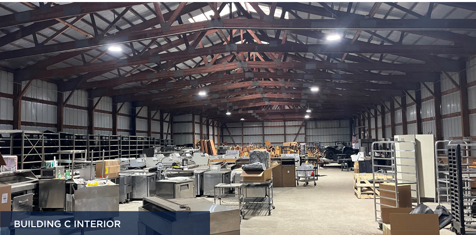
BUILDING C INTERIOR