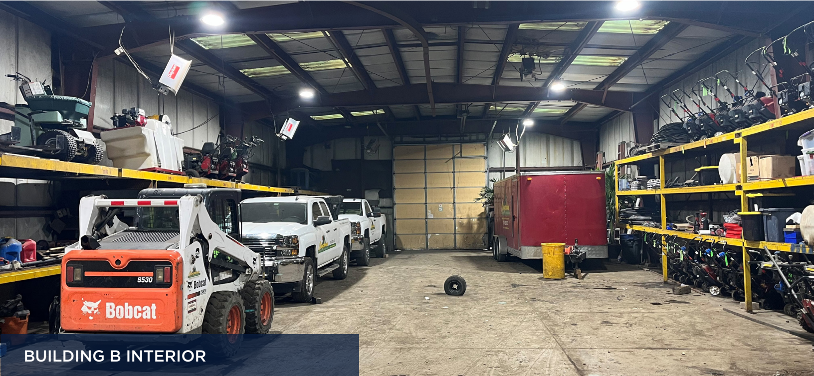
BUILDING B INTERIOR