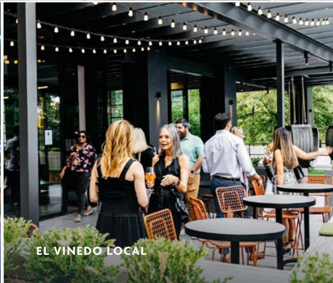
EL VINEDO LOCAL