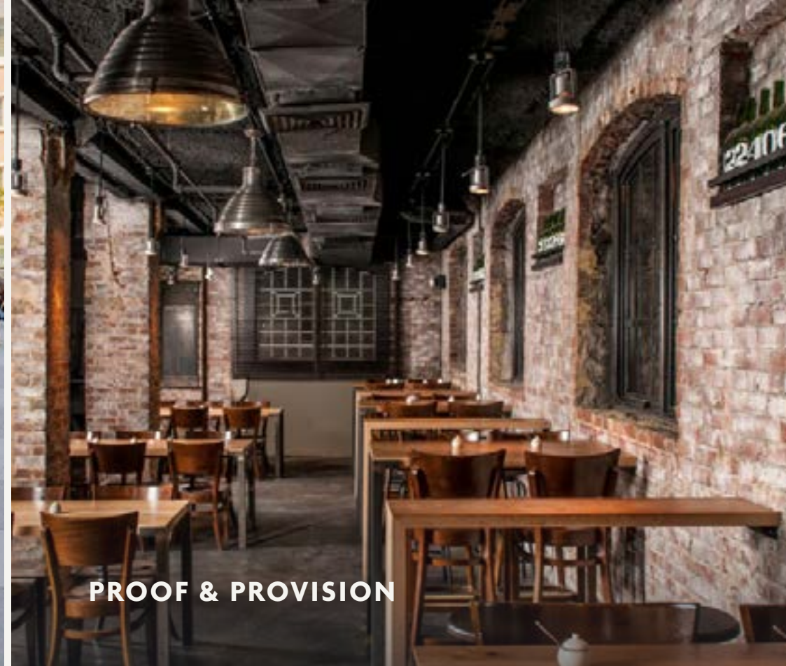
PROOF & PROVISION