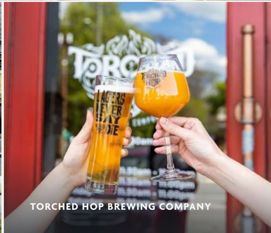
TORCHED HOP BREWING COMPANY