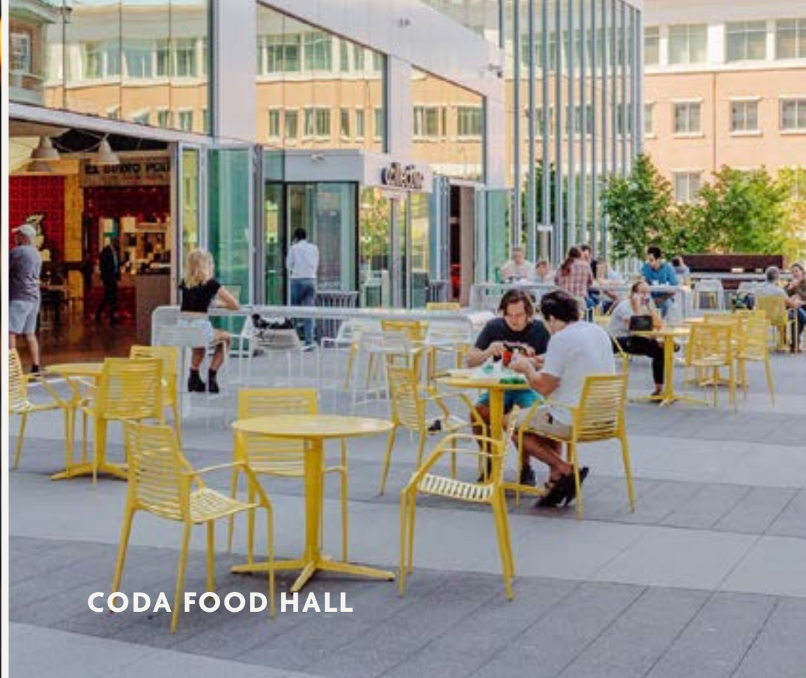
CODA FOOD HALL