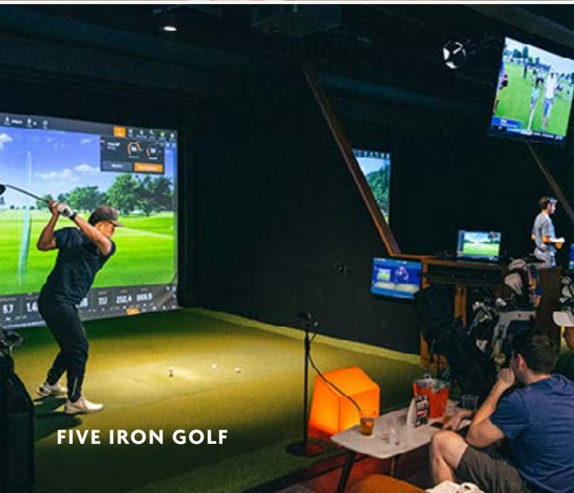
FIVE IRON GOLF