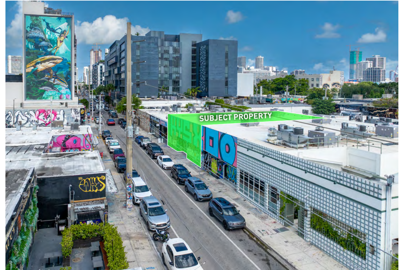
EAST VIEW OF SUBJECT PROPERTY

* Lease rate does not include utilities, property expenses or building services