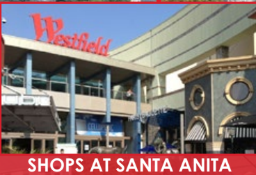
SHOPS AT SANTA ANITA