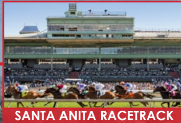
SANTA ANITA RACETRACK