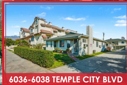
6036-6038 TEMPLE CITY BLVD