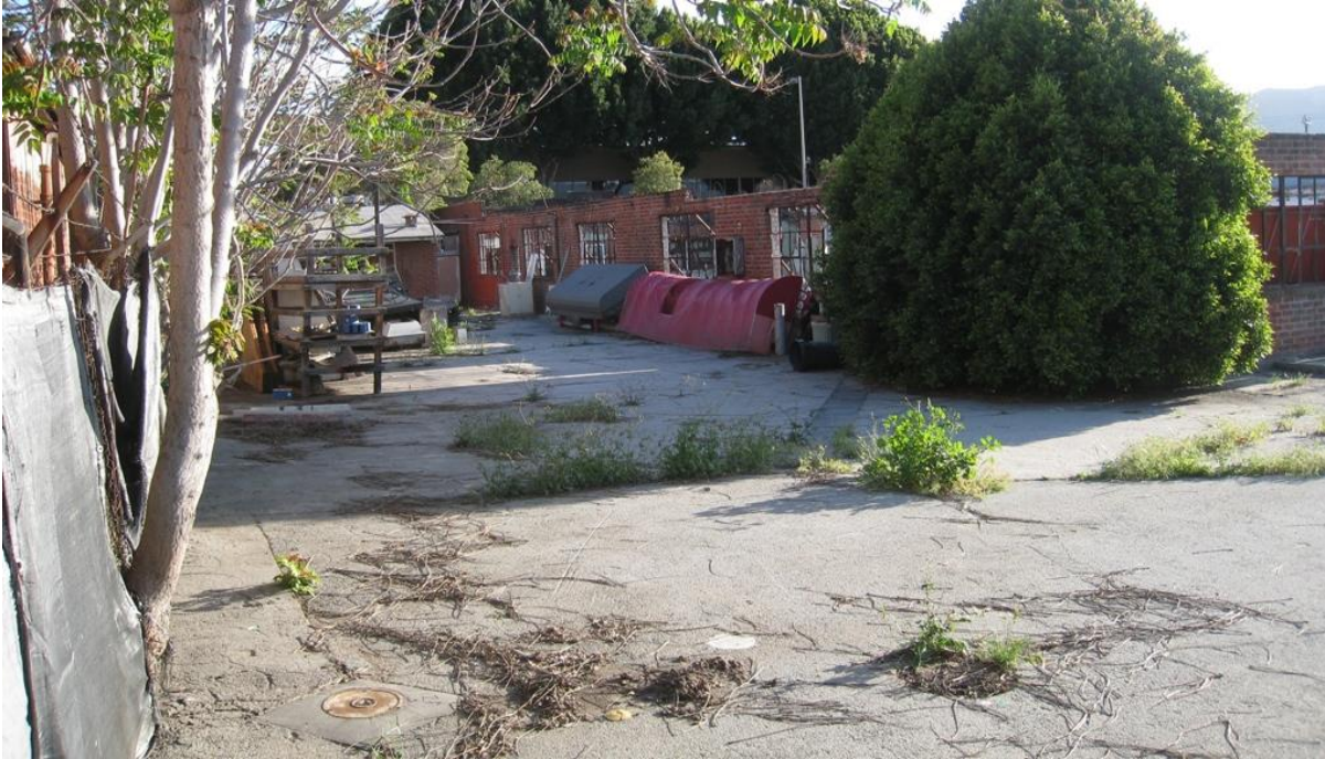
Yard Area 1