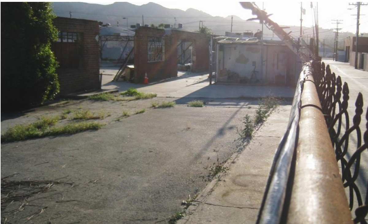
Yard Area 2