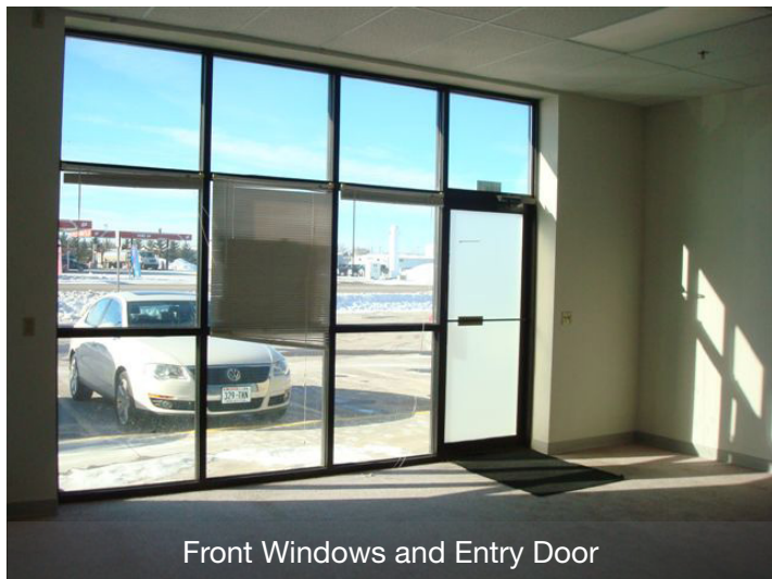
Front Windows and Entry Door