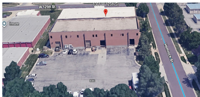
South view of Building, parking