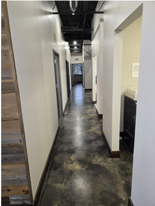
East Hallway 5 offices, RR, Break Area