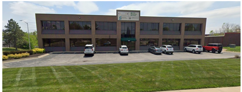
Great Overland Park Location