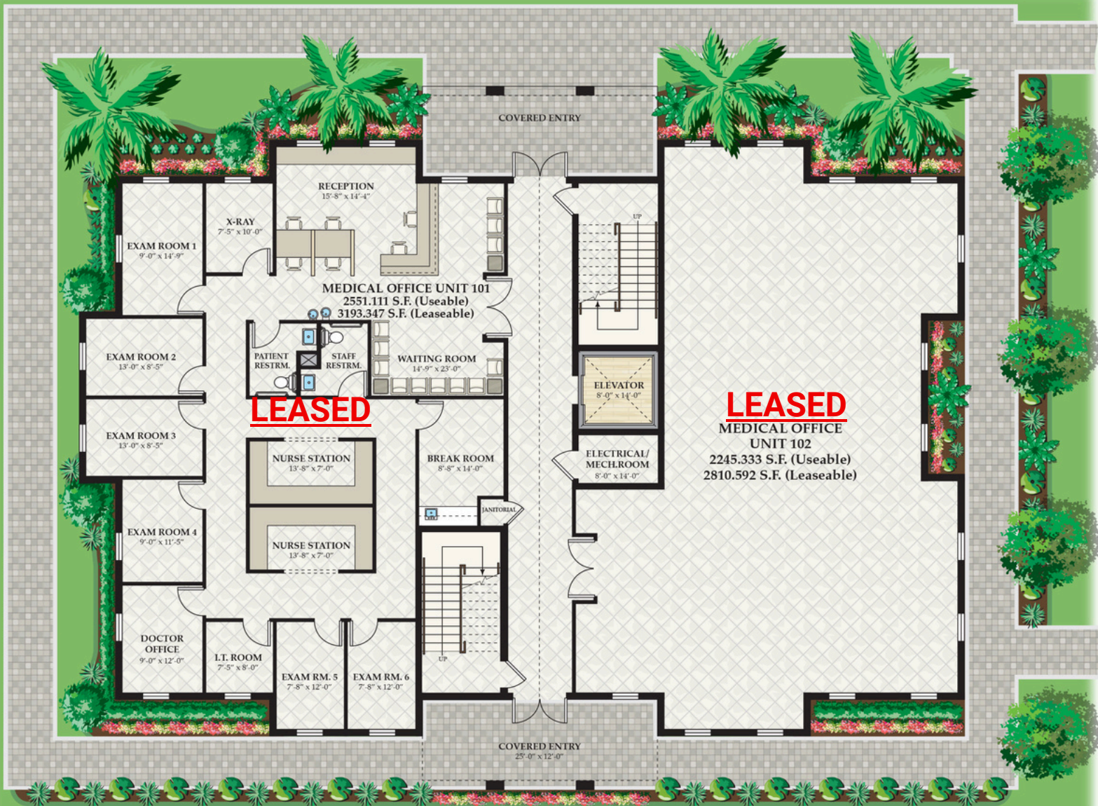
VANDERBILT PROFESSIONAL CENTER MEDICAL BUILDING 1ST LEVEL FLOOR PLAN

Suite 102 (LEASED) - 2245.333 SF Usable - 2810.592 SF Leasable