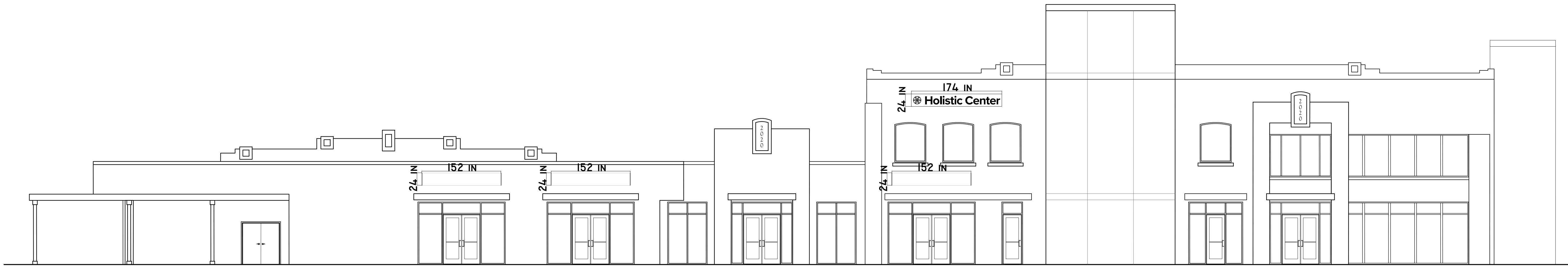
EAST (PRIMARY) ELEVATION SCALE: 1/8" = 1'-0"