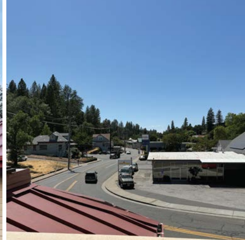
VIEW FROM BUILDING