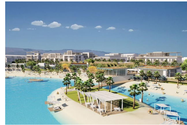
GRAND OASIS CRYSTAL LAGOON