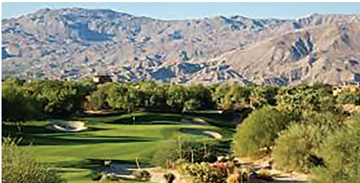
DESERT WILLOW GOLF COURSE