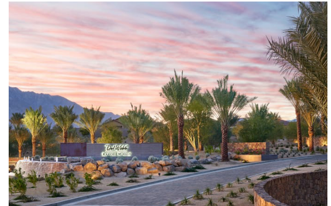
DEL WEBB AT RANCHO MIRAGE