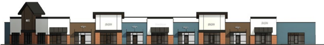
Building B - North & East Elevations