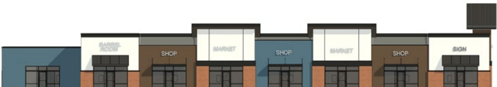
Building A - East & North Elevations