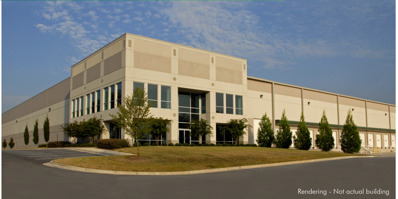
Rendering - Not actual building