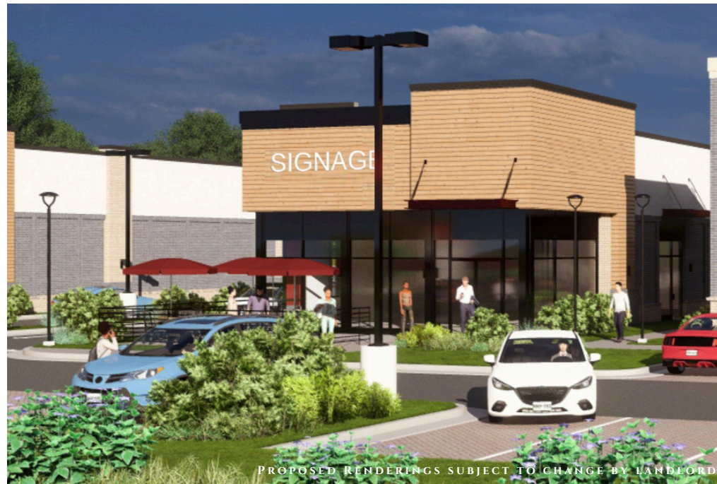
PROPOSED RENDERINGS SUBJECT TO CHANGE BY LANDLORD