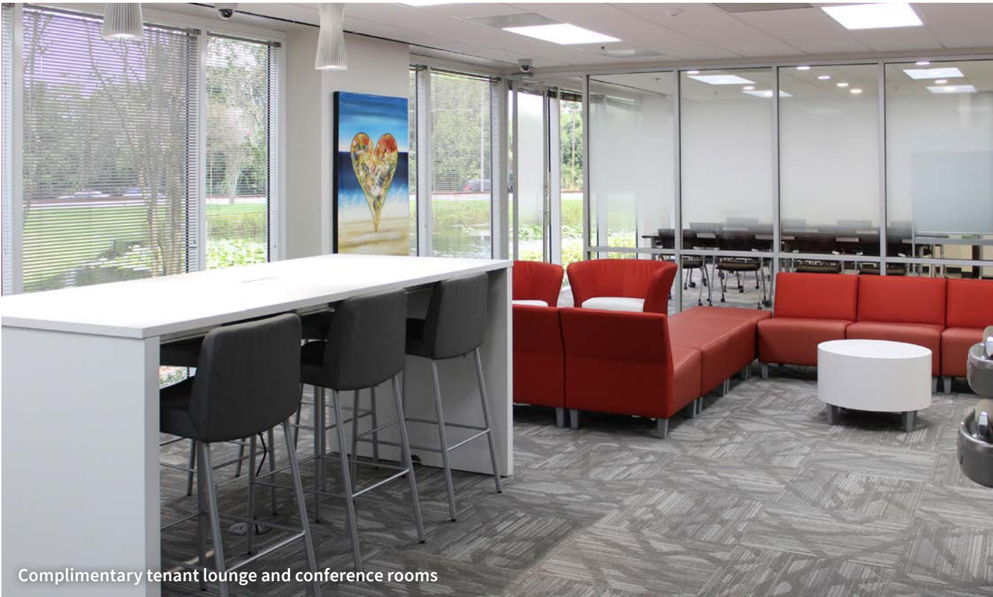
Complimentary tenant lounge and conference rooms