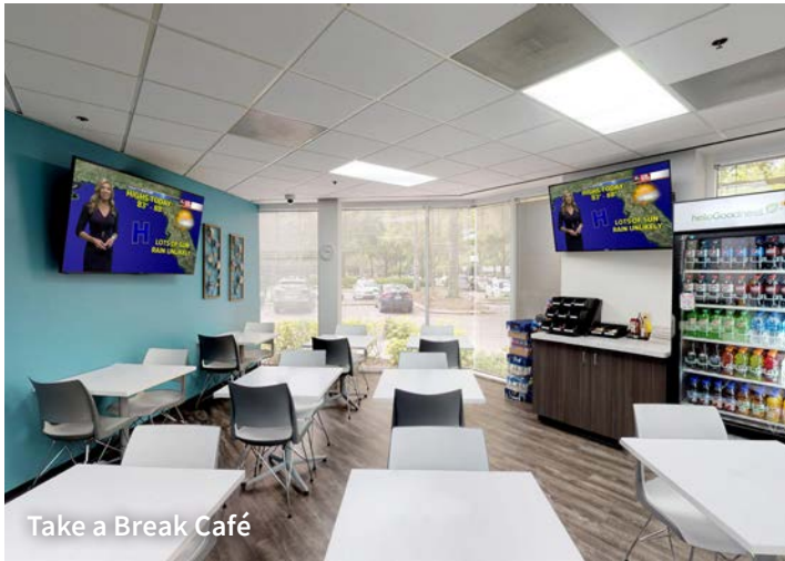
Take a Break Café