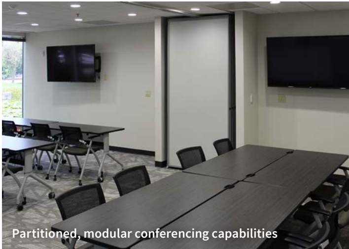
Partitioned, modular conferencing capabilities