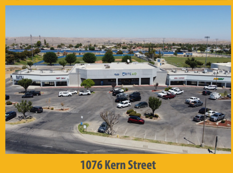
1076 Kern Street