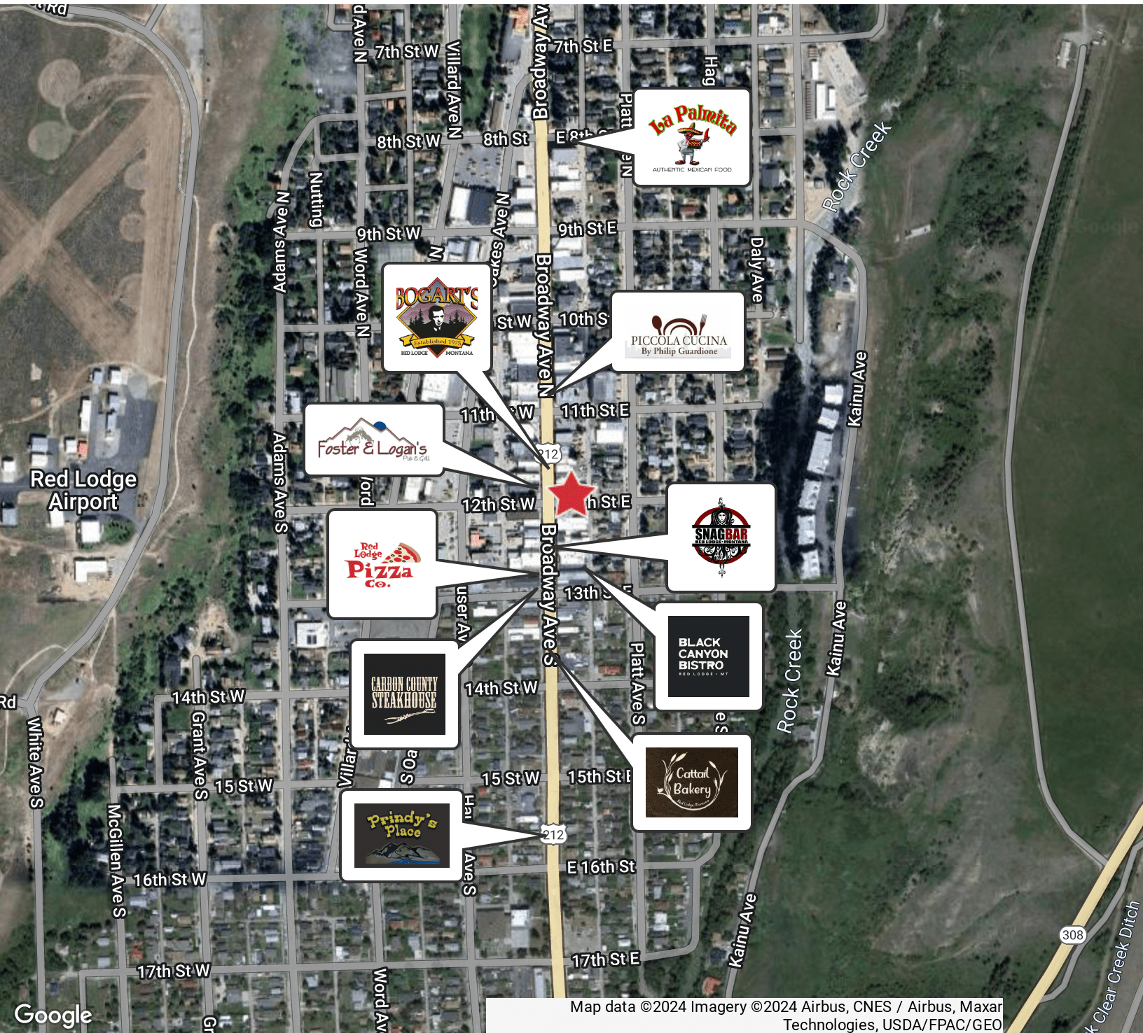
Map data ©2024 Imagery ©2024 Airbus, CNES / Airbus, Maxar Technologies, USDA/FPAC/GEO