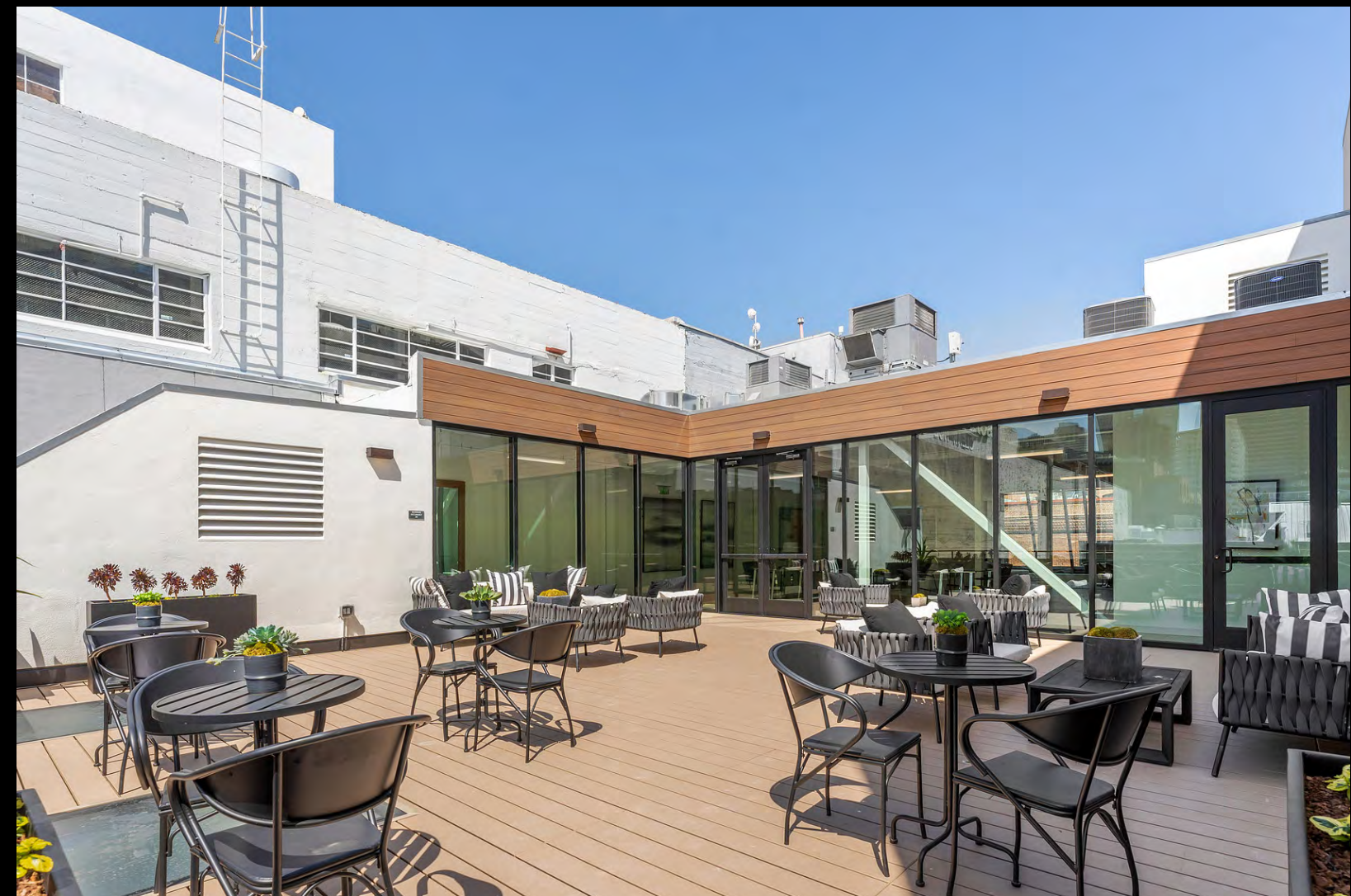
ROOF DECK PHOTOS