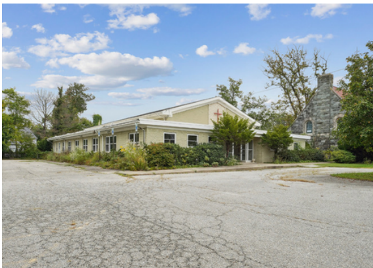
Parking lot: able to park around 70 cars