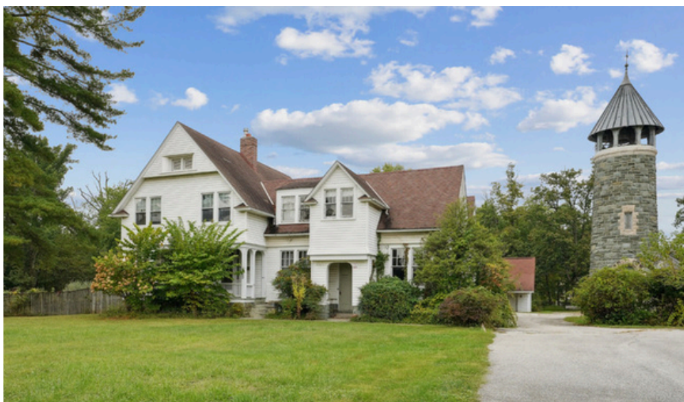
Parish house & bell tower