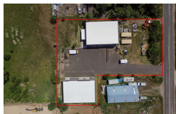
SOUTH END OF MCCALL