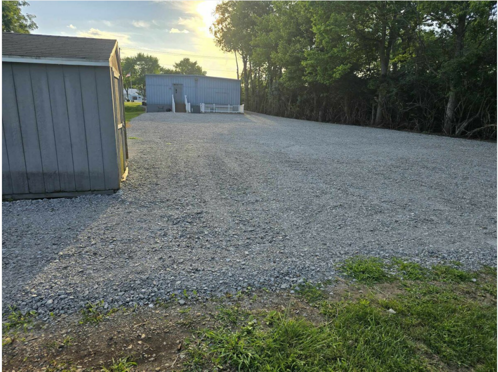
Rear Parking Lot 4