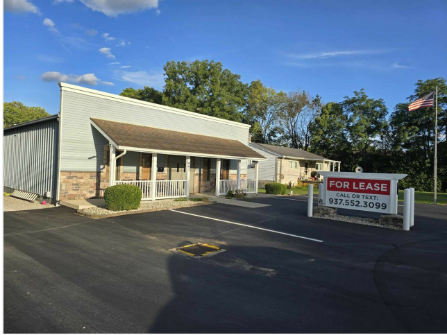
Street View North