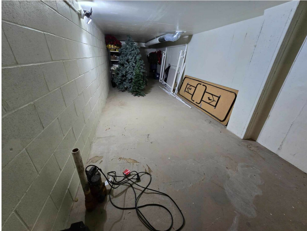
Storage Bay 4