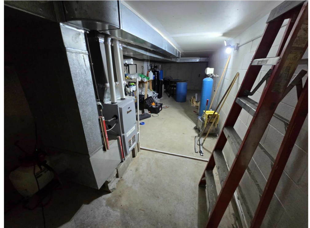
Storage Bay 1