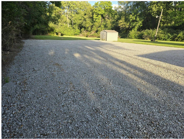
Rear Parking Lot 1