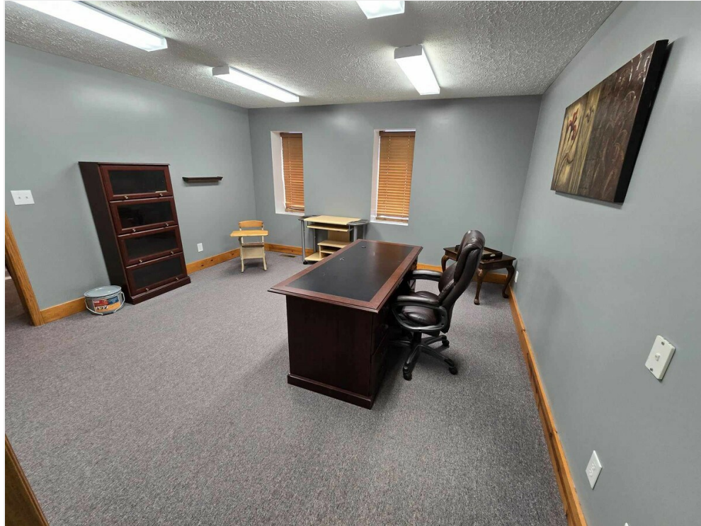
Office 1 view 1