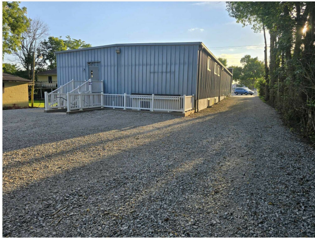
Rear Parking Lot 2