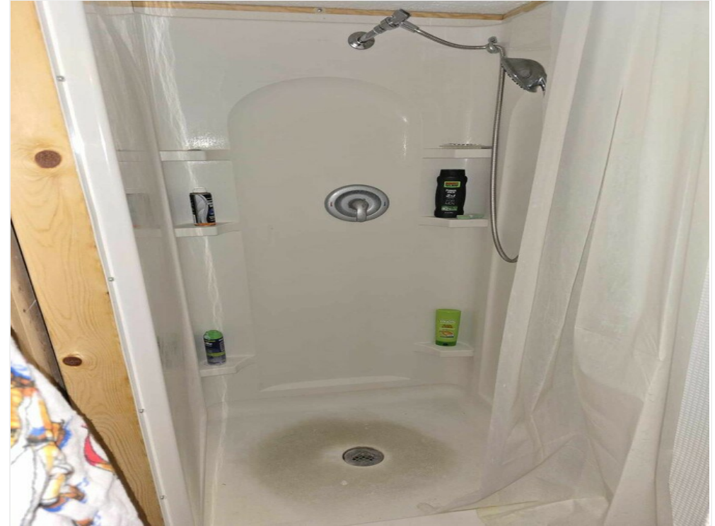
Lower Level Shower