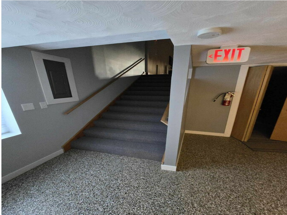
Steps to Lower Level