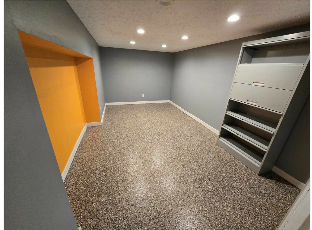
Lower Level Room 2