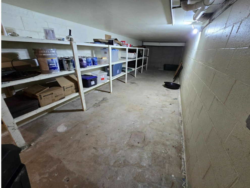
Storage Bay 2