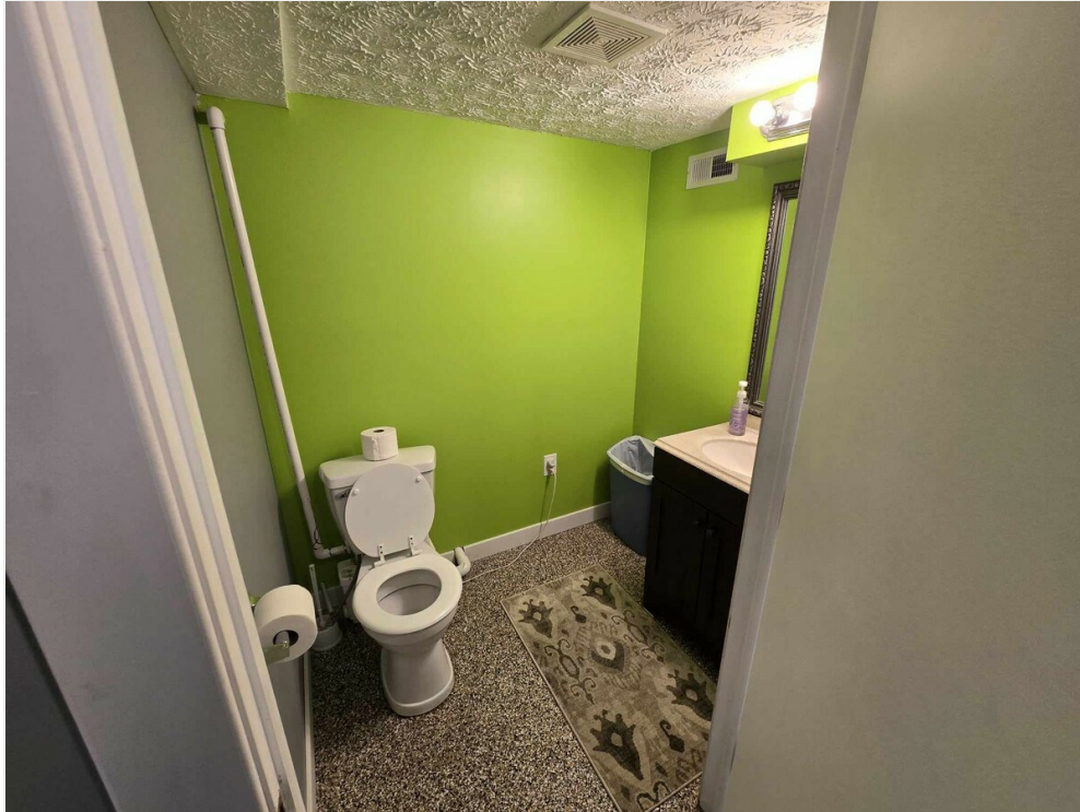
Lower Level Restroom