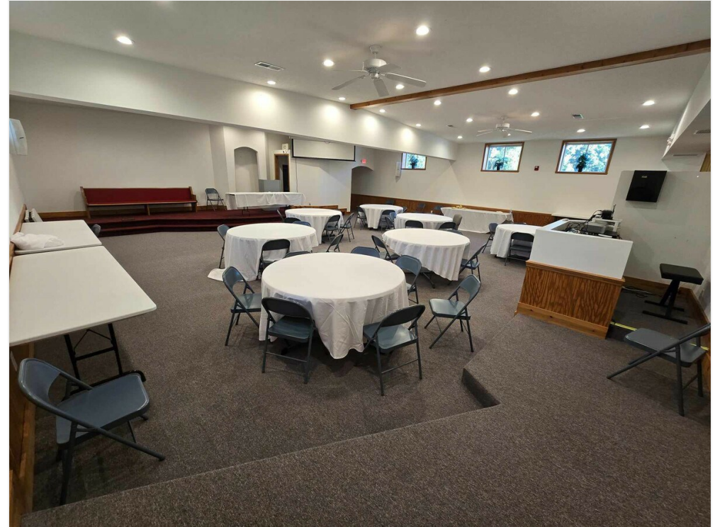
Meeting Room 1