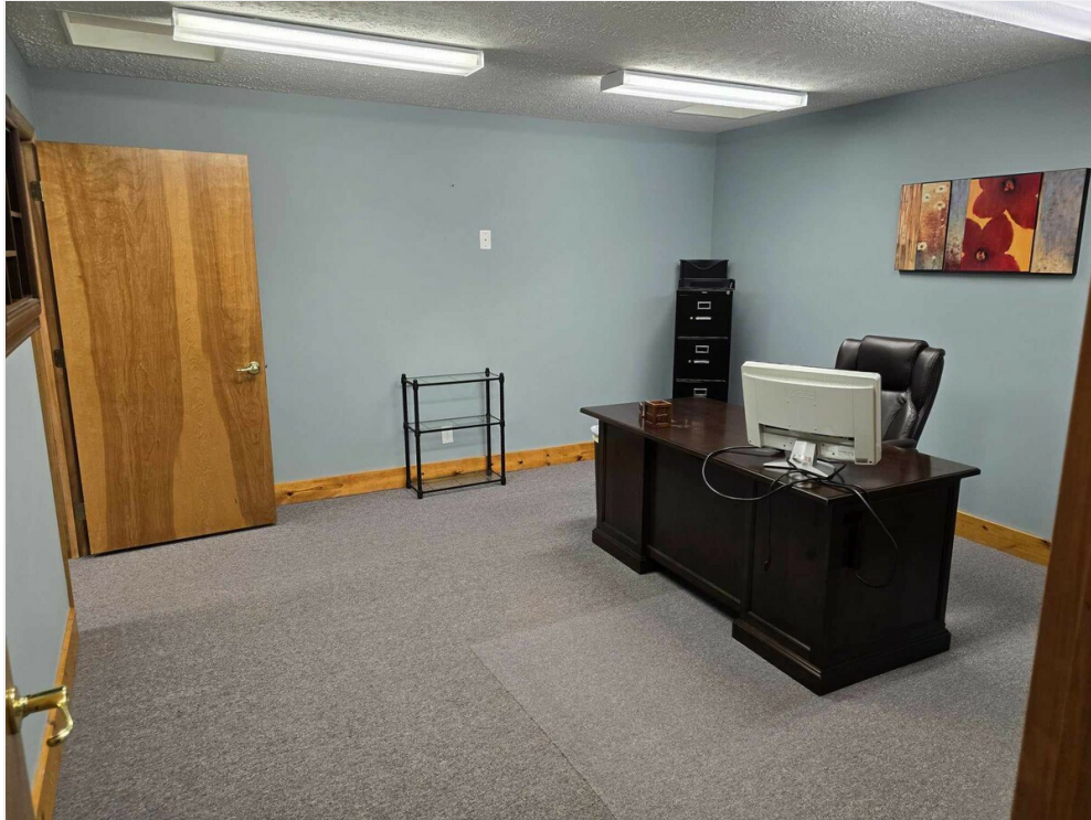
Office 2 view 1