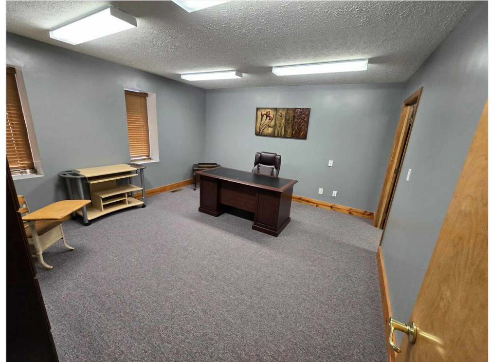
Office 1 view 2