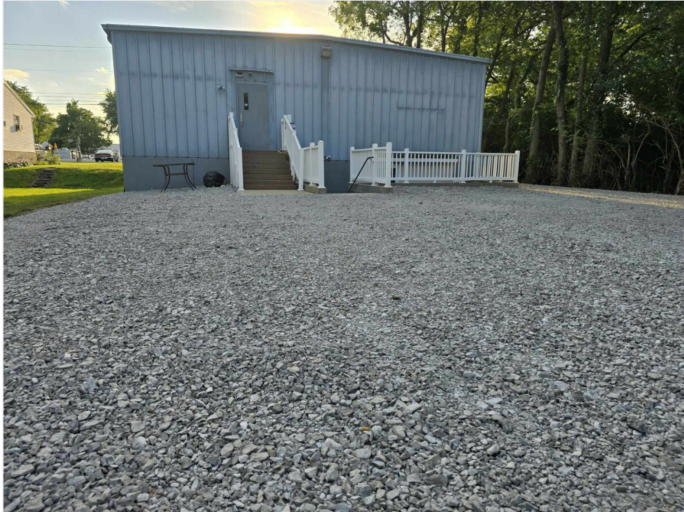
Rear Parking Lot 3