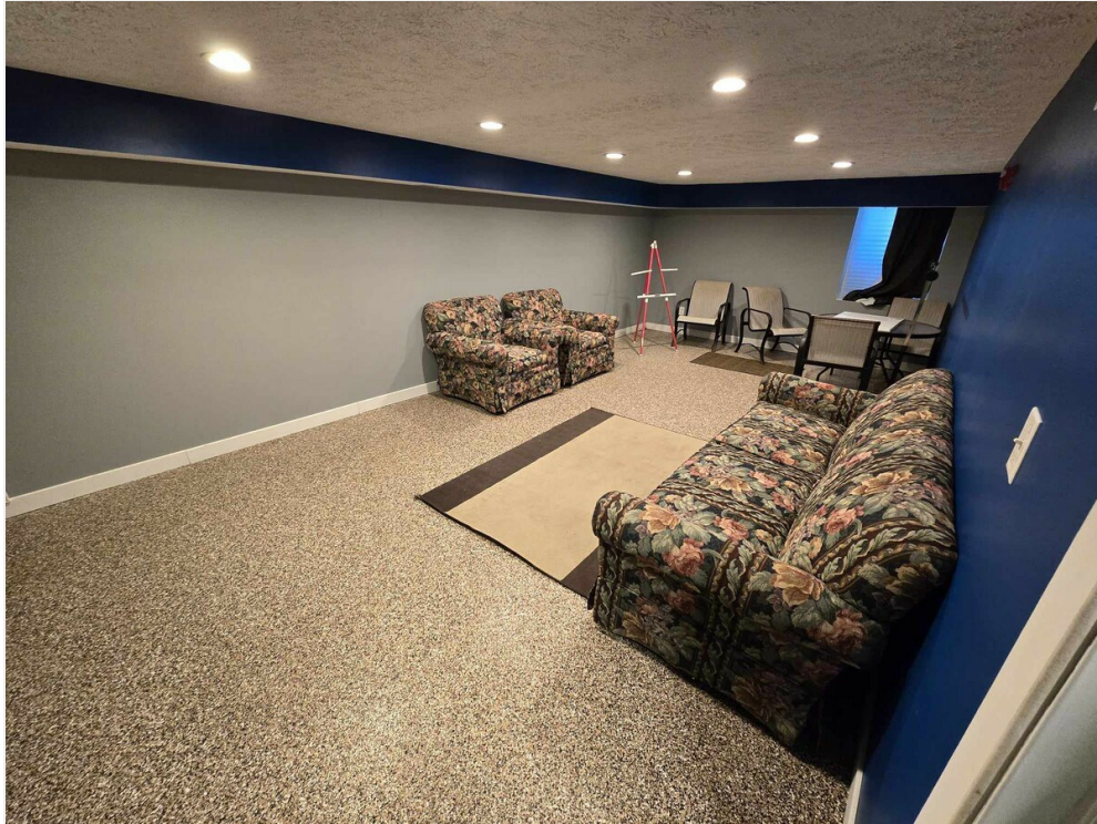
Lower Level Room 1