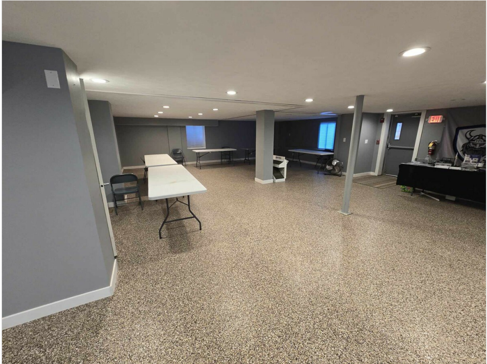
Lower Level Meeting Room