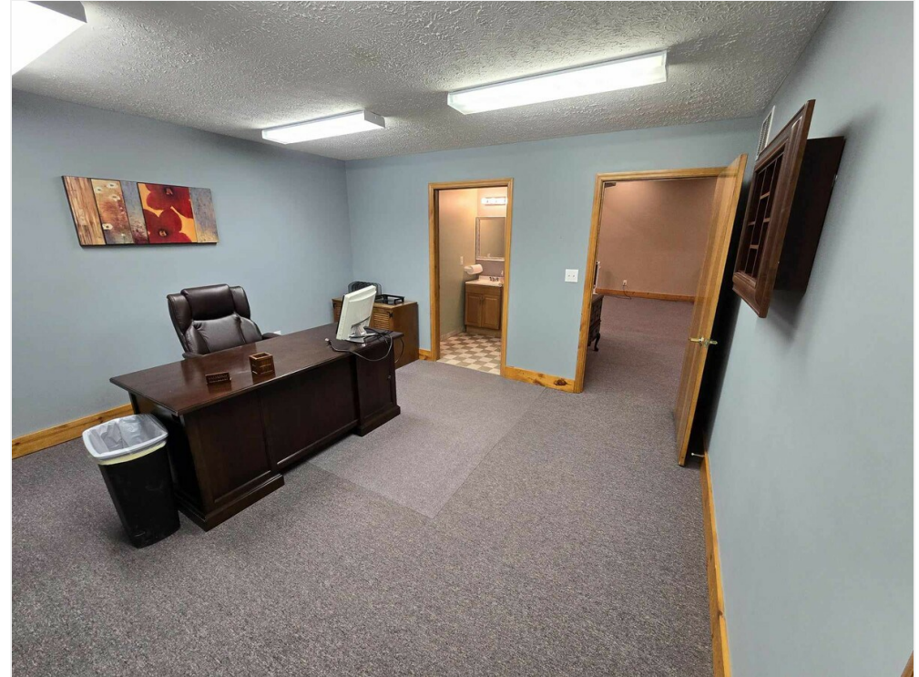
Office 2 view 2