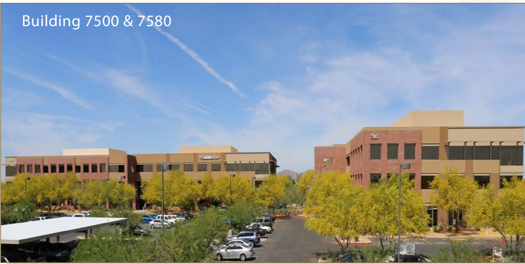
Building 7500 & 7580