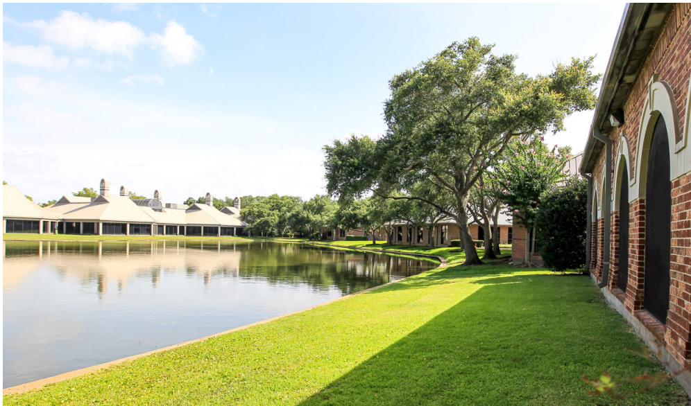
Avison Young | 4501 Sweetwater Blvd | Sugar Land, TX 77479