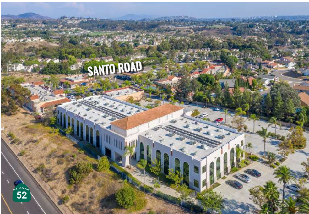
6050 Santo Road