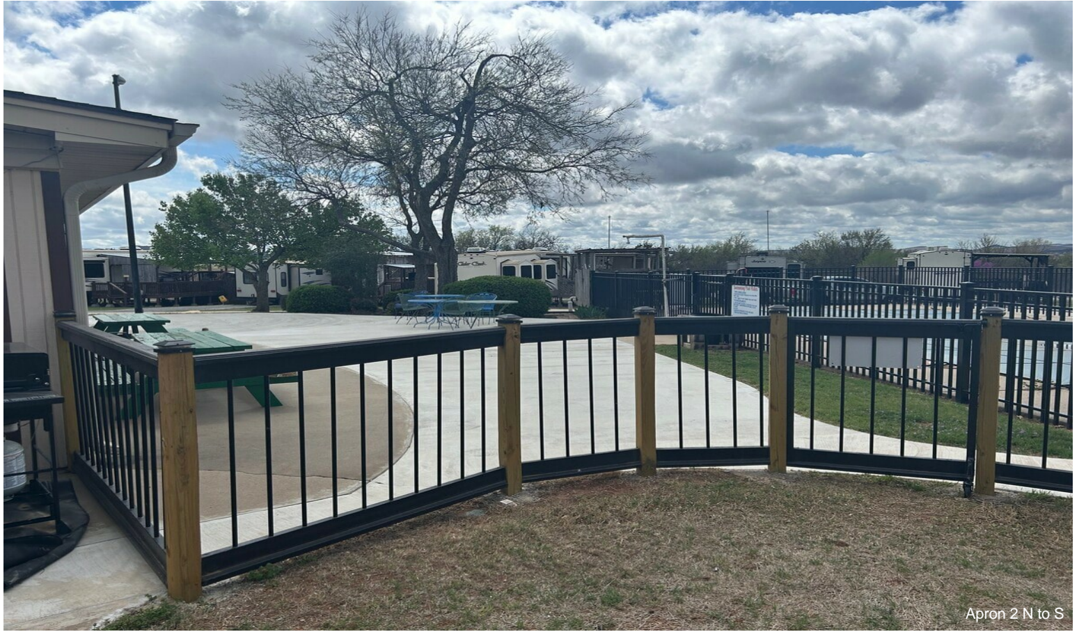
Apron 2 N to S