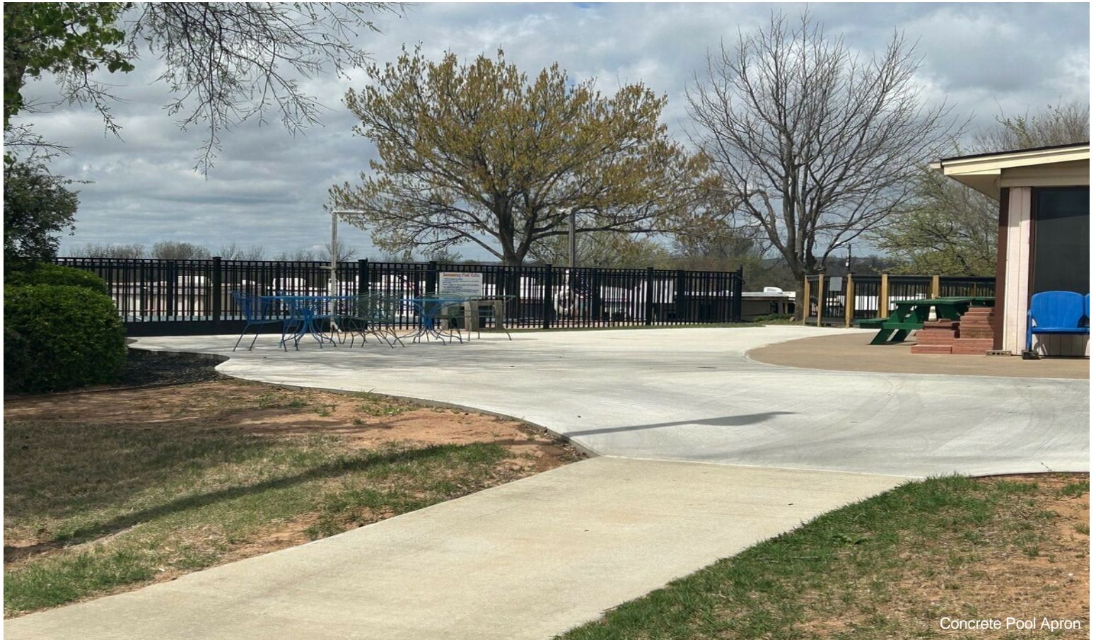
Concrete Pool Apron