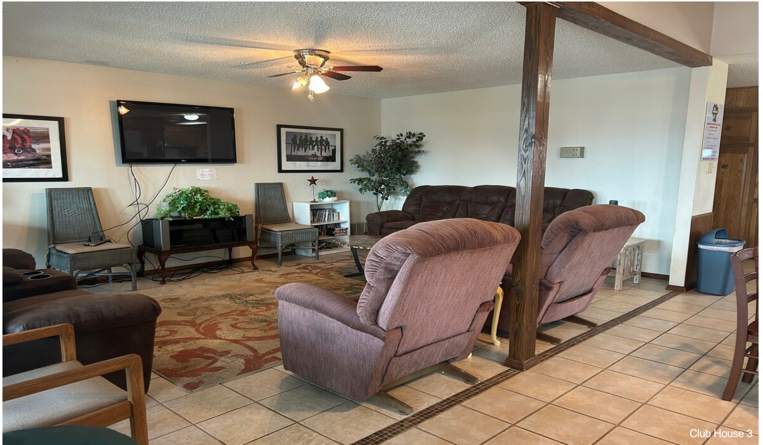
Club House 3