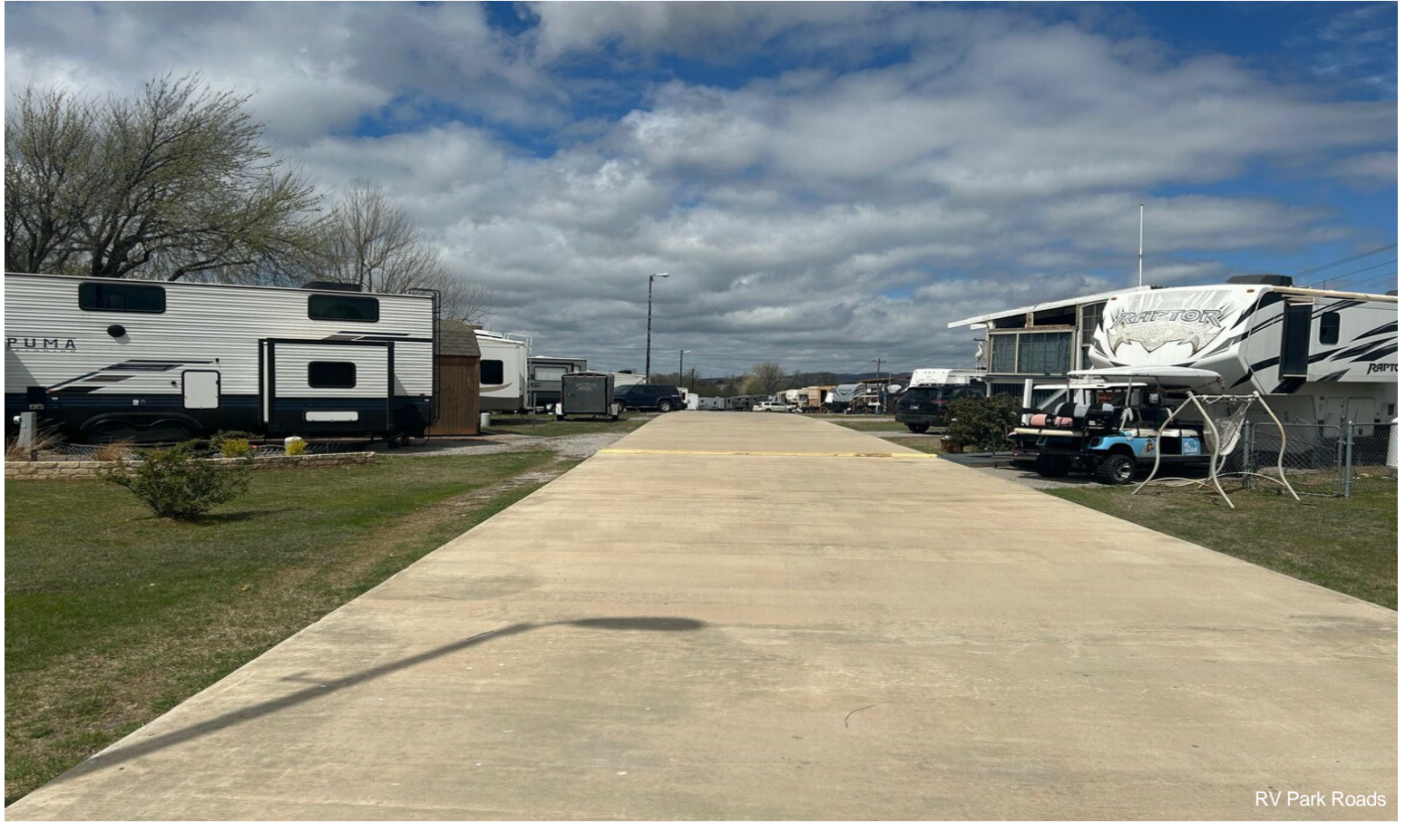
RV Park Roads