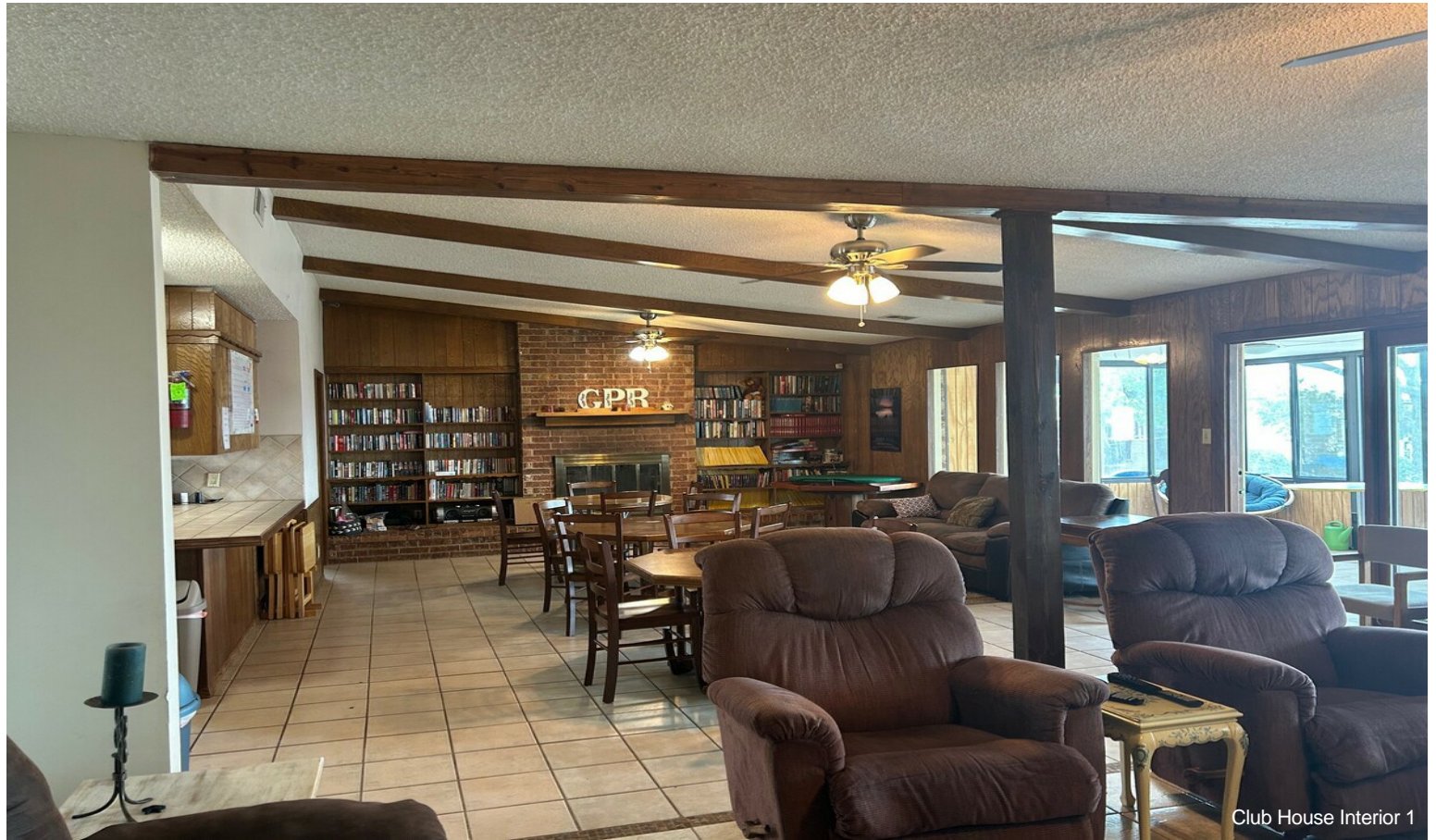
Club House Interior 1