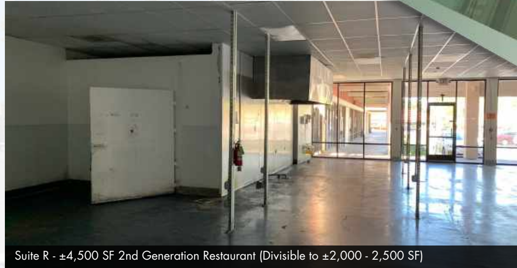
Suite R - ±4,500 SF 2nd Generation Restaurant (Divisible to ±2,000 - 2,500 SF)