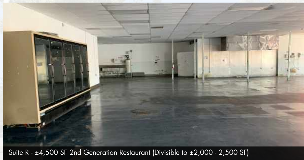
Suite R - ±4,500 SF 2nd Generation Restaurant (Divisible to ±2,000 - 2,500 SF)