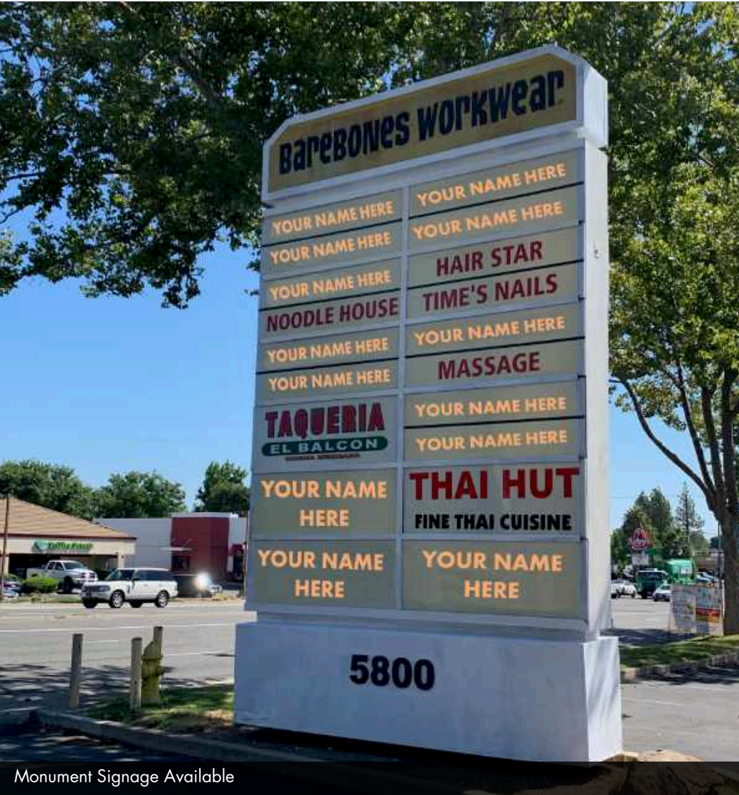
Monument Signage Available