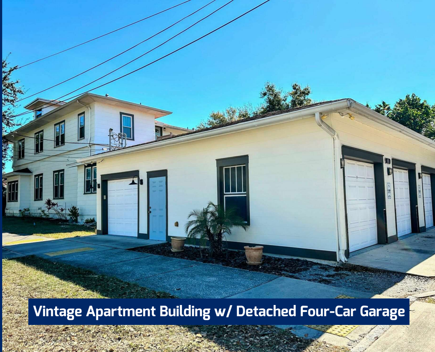
Vintage Apartment Building w/ Detached Four-Car Garage