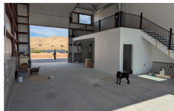
MEZZANINE UNIT 2,100 SQ FT