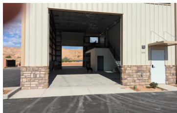
DRIVE THRU BAY DOORS 14 X 14 FRONT/12 X 12 REAR