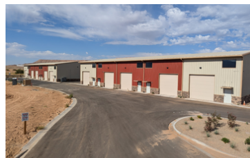
BUILDINGS 1 & 2