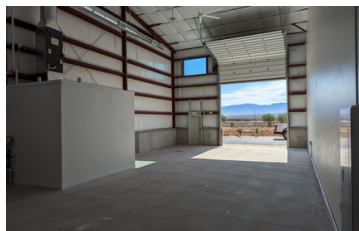
30' X 60' WITH ADA BATHROOM