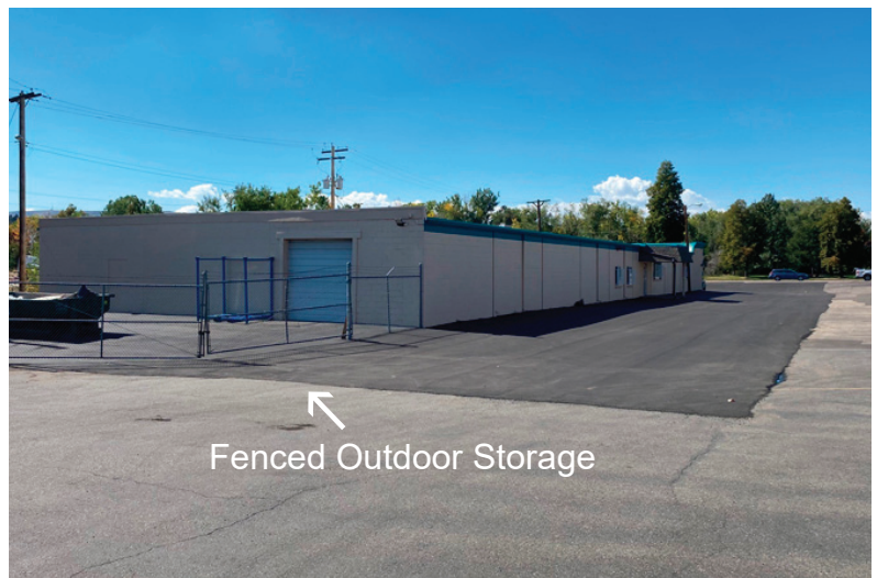
Fenced Outdoor Storage