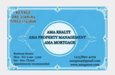
AMA Realty 3101 San Jose Ave. San Francisco, CA 94112