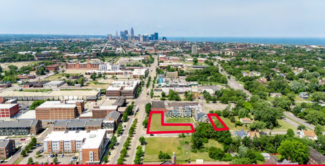
~ 2 MILES TO DOWNTOWN CLEVELAND