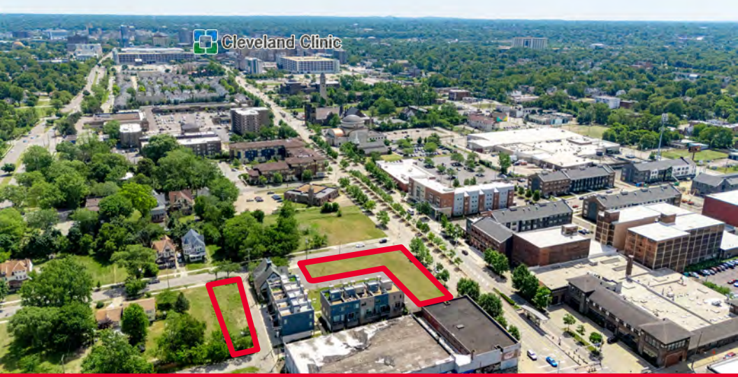
CLOSE PROXIMITY TO THE CLEVELAND CLINIC & UNIVERSITY CIRCLE