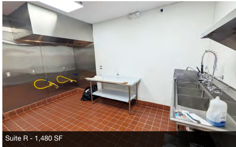
Suite R - 1,480 SF