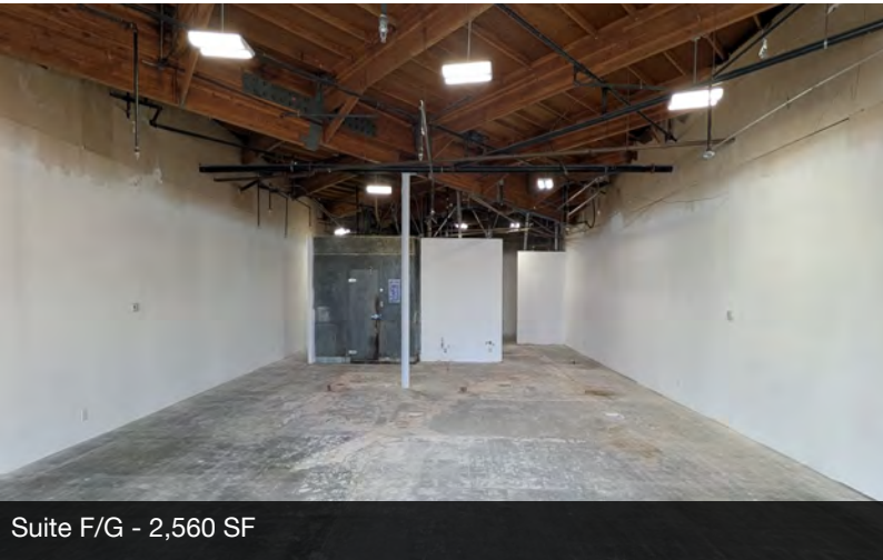
Suite F/G - 2,560 SF