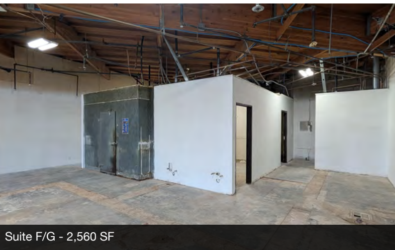
Suite F/G - 2,560 SF