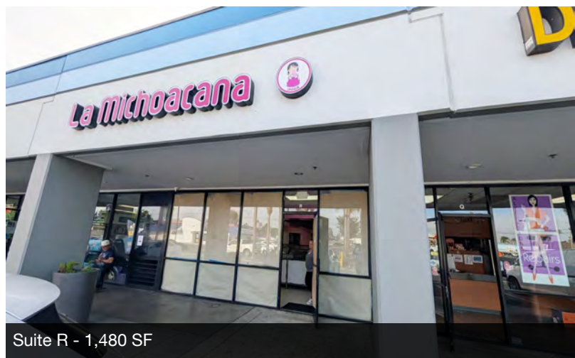
Suite R - 1,480 SF