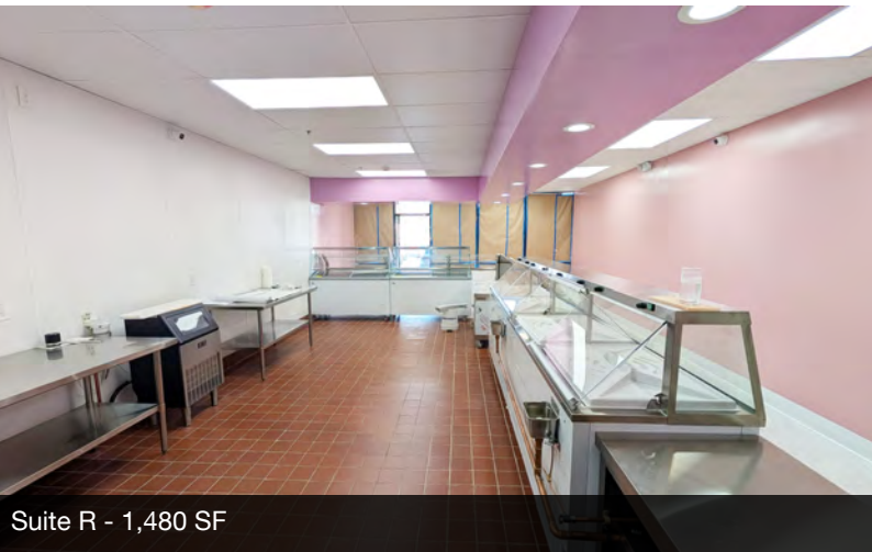
Suite R - 1,480 SF