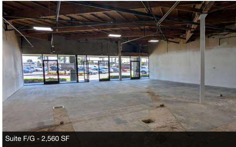
Suite F/G - 2,560 SF