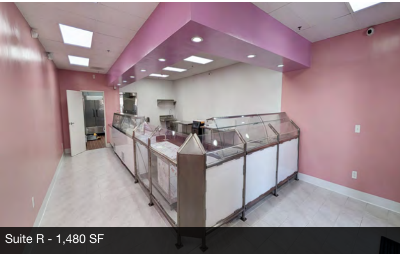
Suite R - 1,480 SF