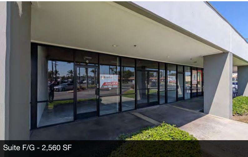
Suite F/G - 2,560 SF