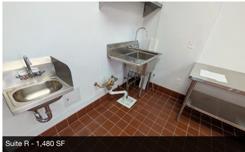
Suite R - 1,480 SF