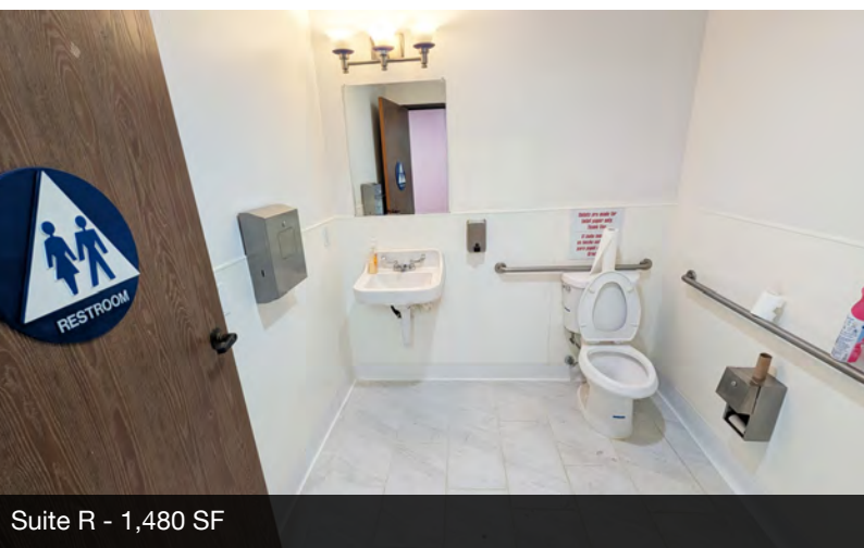
Suite R - 1,480 SF