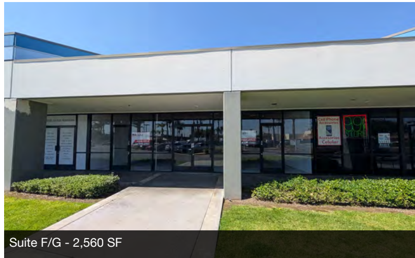
Suite F/G - 2,560 SF