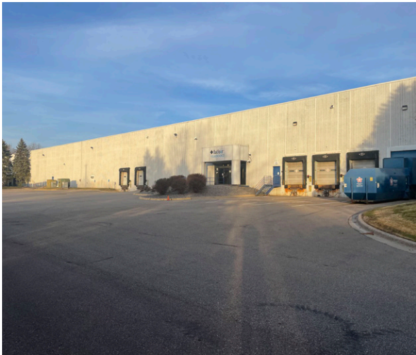
Loading: 9 docks, 1 drive in