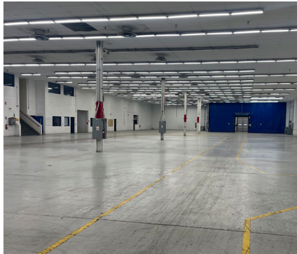
19' clear dropped ceiling Fully air-conditioned