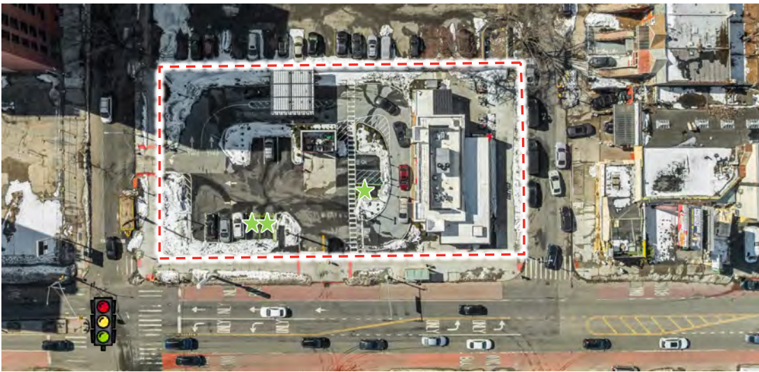
★ EV Charging Stations