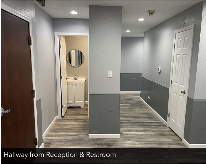
Hallway from Reception & Restroom