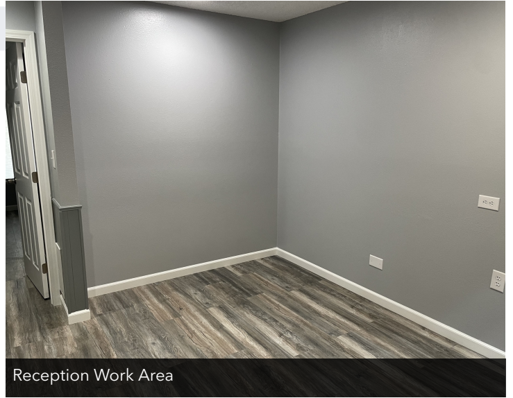
Reception Work Area