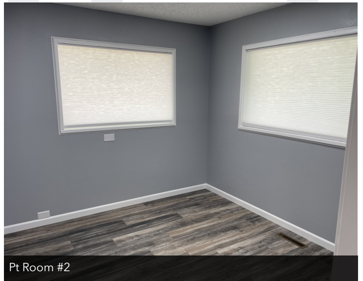
Pt Room #2