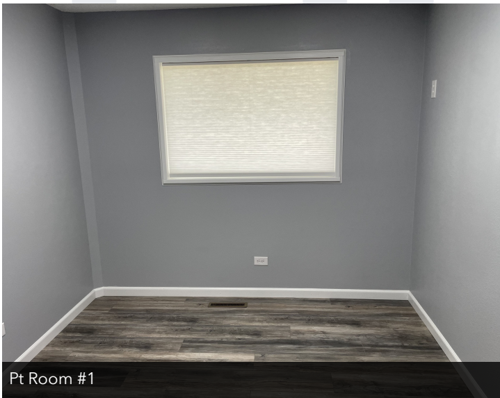
Pt Room #1