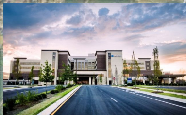
Baptist Hospital Oxford