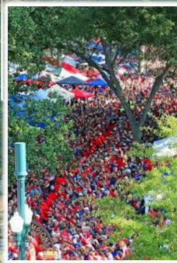
The Grove US HWY 278