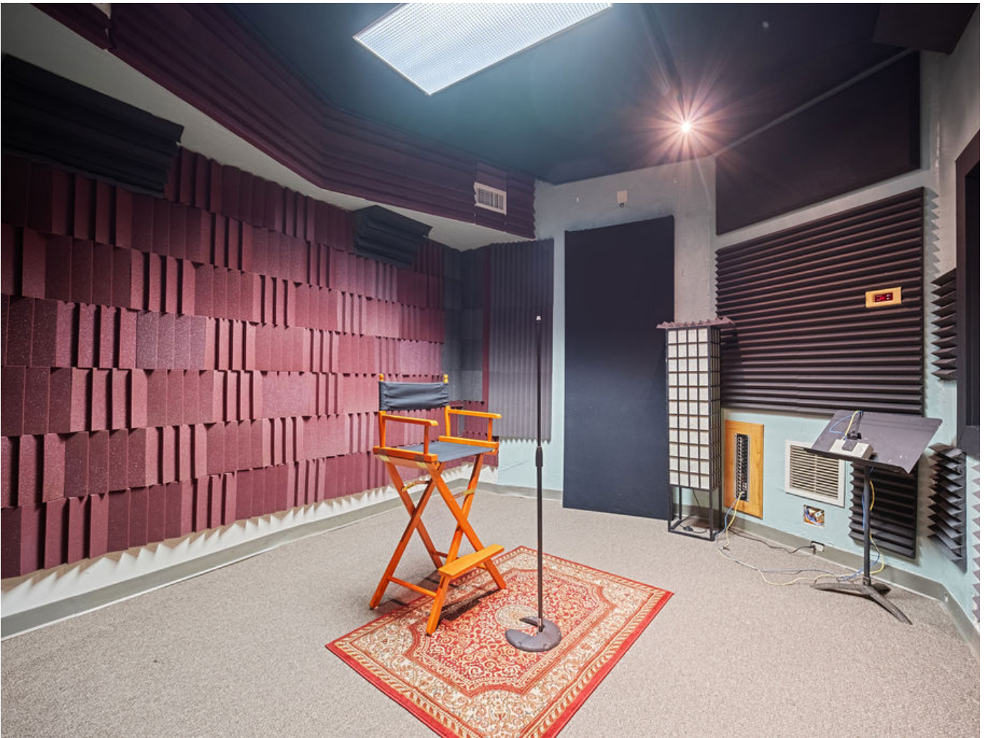
3-SIDED CYCLORAMA WALL