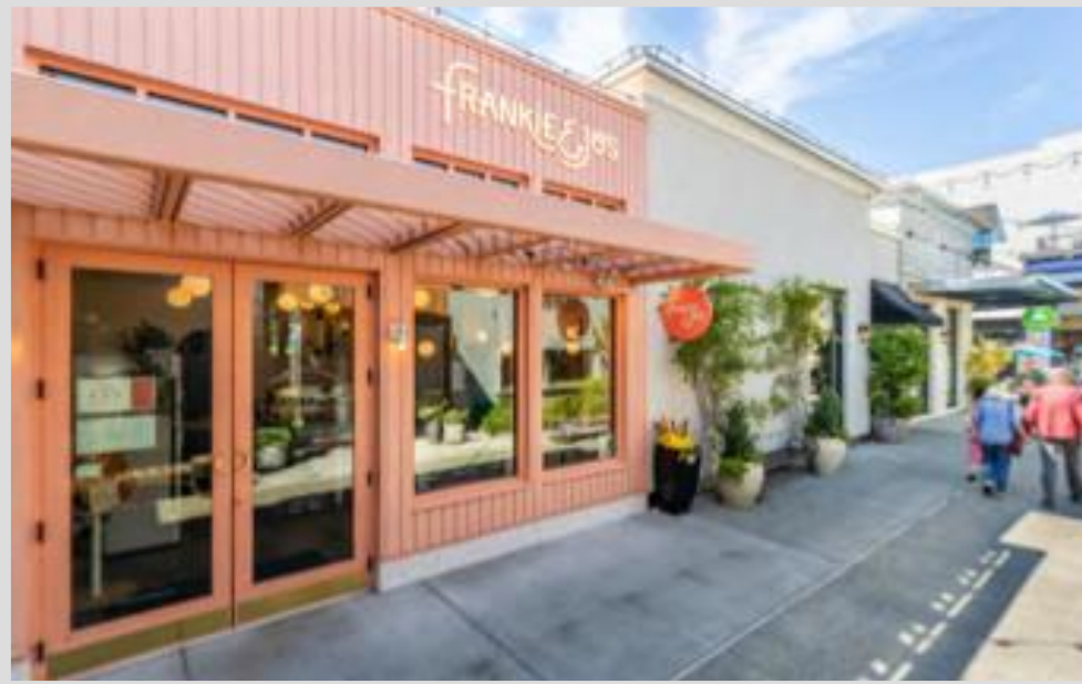
The University Village is a fantastic collection of shops and restaurants. Some of the highlights include an Apple Store, Franz Chocolate, Joey's Kitchen, Pottery Barn, Din Tai Fung, Tommy Bahama, Allbirds, Restoration Hardware, Anthropologie, & Banana Republic. This open air shopping center is a hallmark of the area, a bustling place in the summer time, and has many covered walkways so one can enjoy shopping even on Seattle's grayest days.