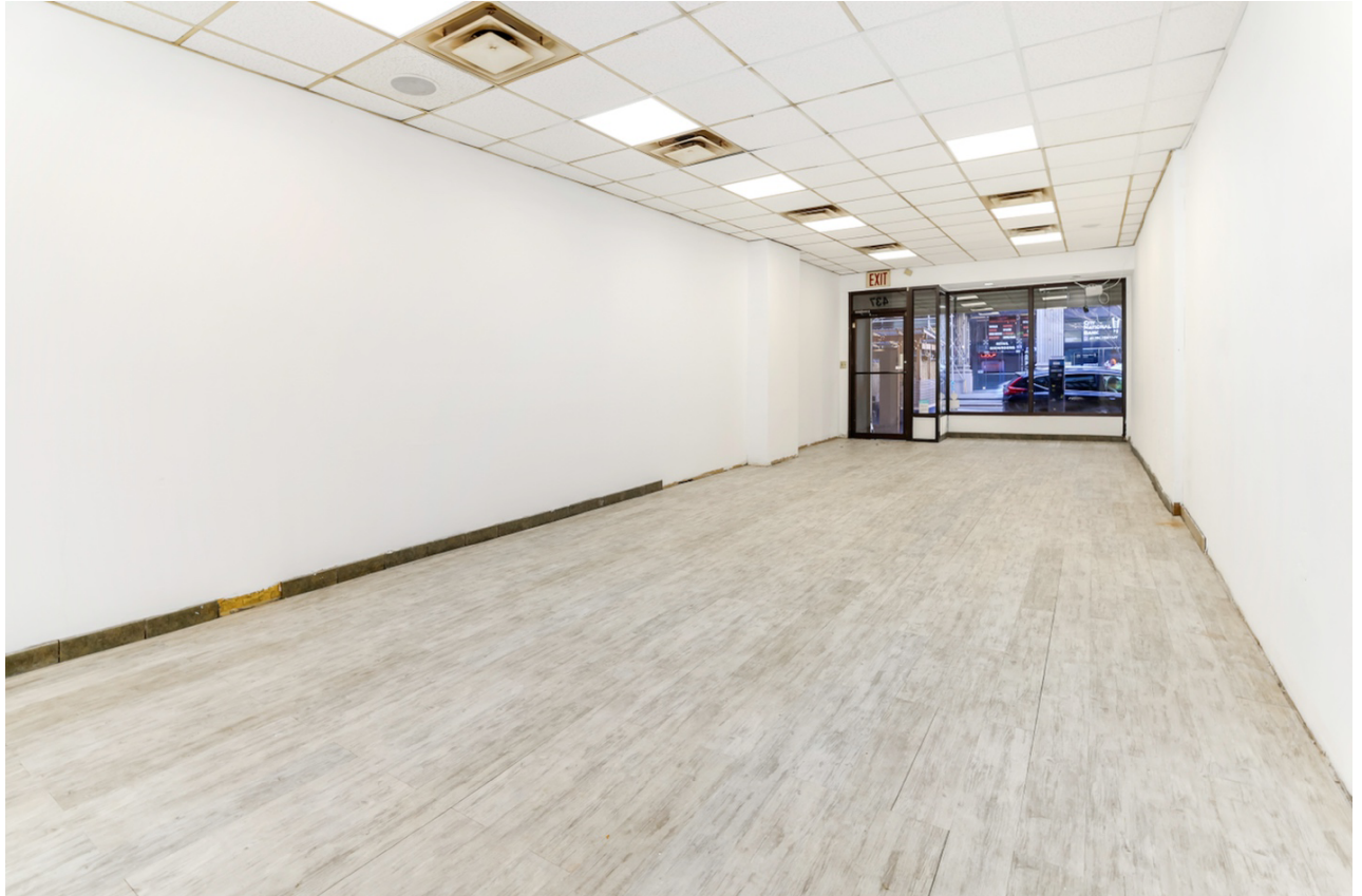
437 PARK AVENUE SOUTH COMMERCIAL SPACE