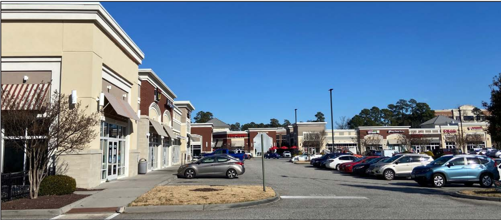
Jefferson Marketplace | 12515 Jefferson Avenue, Newport News, Virginia