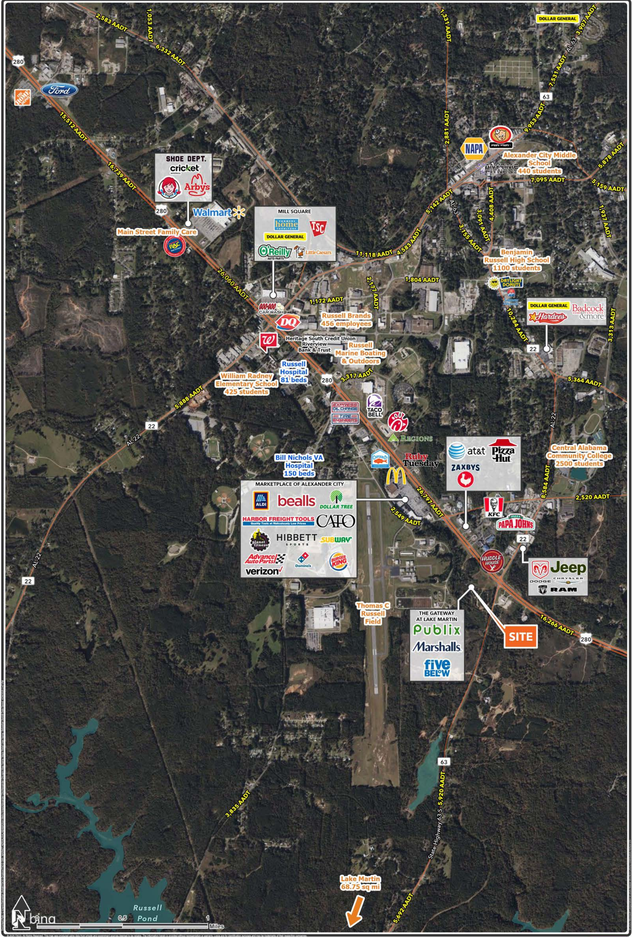
Alexander City, Alabama Major Retail Aerial