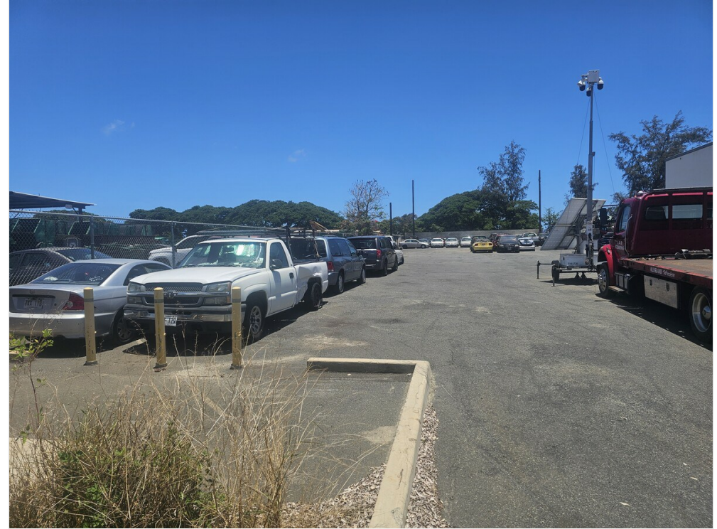
Current Picture of 1152 Mikole