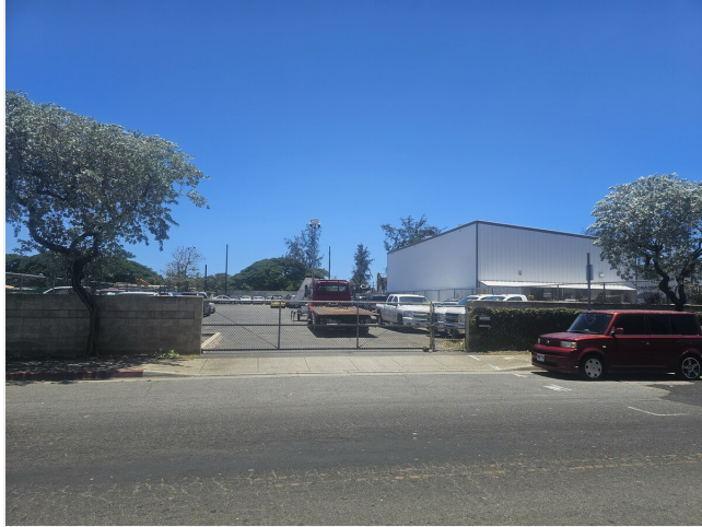
Current Picture of 1152 Mikole