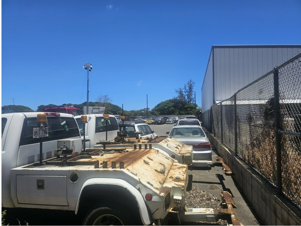
Current Picture of 1152 Mikole